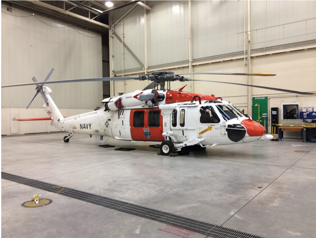
Figure 1. MH-60 Search and Rescue Helicopter Stationed at NAS Whidbey Island.

accommodate these personnel requirements and changes. These considerations are certainly germane to manpower and personnel systems analysis.