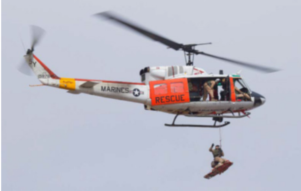
Figure 4. Bell HH-1N Huey out of Marine Corp Air Station Yuma in Arizona.

For the Marine Corps SAR mission, the aircraft being utilized were the HH-1Y (Figure 4), which were prematurely being replaced despite the presumption of a 30-year life cycle. We were not facing the same issue, as we needed to find the answer to a dwindling MH-60 fleet due to growing operational commitments. Unlike the HH-1Y scenario, we were looking for aircraft platforms that were already outfitted for the SAR mission. Comparable to the model that Collins and Williamson created, we broke down our costs into categories for the status quo and each of our courses of action. They broke down their annual costs into the following five categories: level of manpower, unit level operations, maintenance and support, sustainment and support, and continuing system improvements. As we began to gather information, we found that we would need to break down our costs into six or seven categories. To forecast the operational and support costs, they used double exponential smoothing, but we used the consumer price index and historical data to ensure we achieved the best possible estimates.