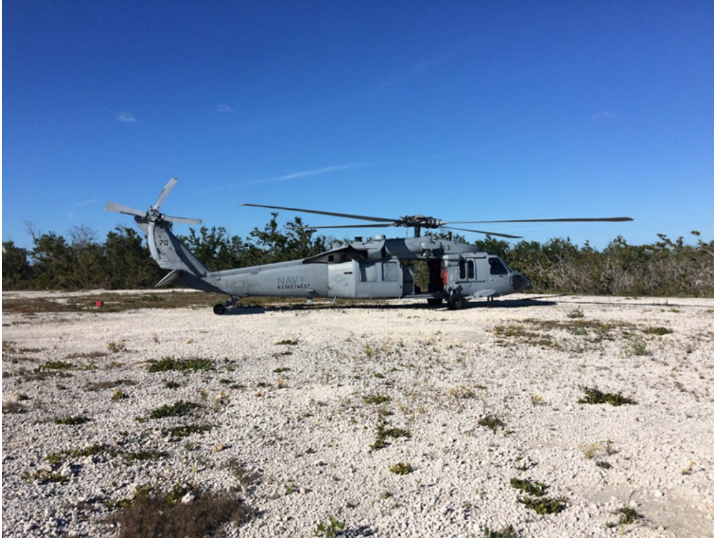
Figure 5. MH-60S – Search and Rescue Aircraft during Training Flight near NAS Key West.

Given that the H145 is currently employed at NAS China Lake, we have no reason to believe that it could not meet altitude requirements at other NAS SAR locations with significant mountainous terrain, such as NAS Lemoore or NAS Whidbey Island. We were also unable to determine the internal capacity of the H145 and if medical and gas tank requirements would allow for its smaller internal spacing capacity as compared to the MH-60 (Patrick Cleary and LT Adam Granic, personal communication February 12, 2019). Given the pricing and unknown factors, we could not make an appropriate determination or evaluation using this aircraft, and therefore did not choose the H145 as a feasible option for future SAR employment for this analysis.