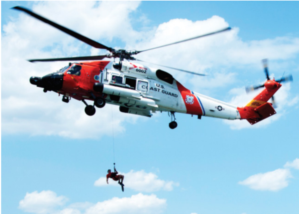
Figure 2. U.S. Coast Guard MH-60T Conducting SAR off the Coast of Tampa Bay, FL.