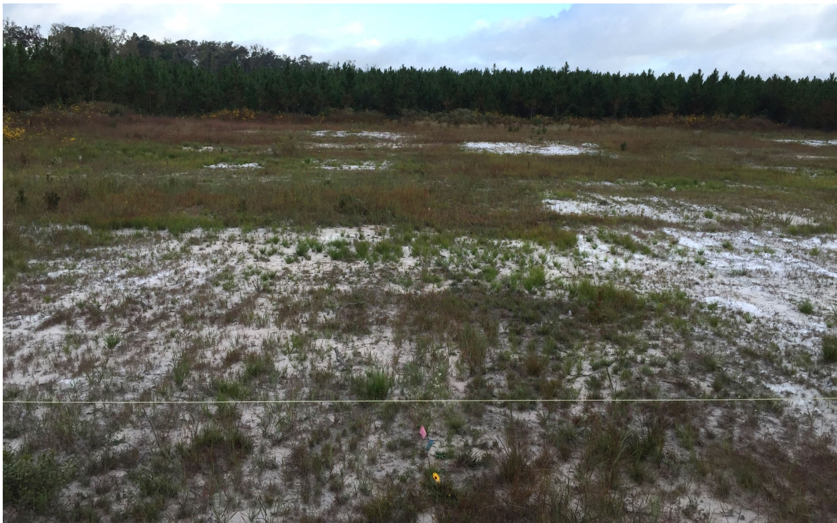
Figure 13. Paper application after one growing season. The paper is still visible in 24 and 32 tons per acre application rates. Areas where paper is not visible received paper application rates of 16 tons per acre or less.