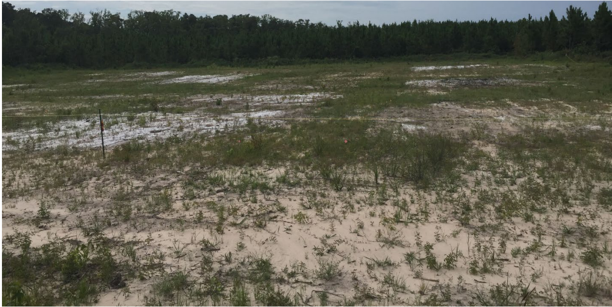
Figure 12. Three months after incorporation of paper and seeding.