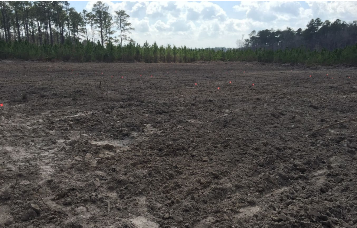
Figure 7. Prepared site ready for paper application.