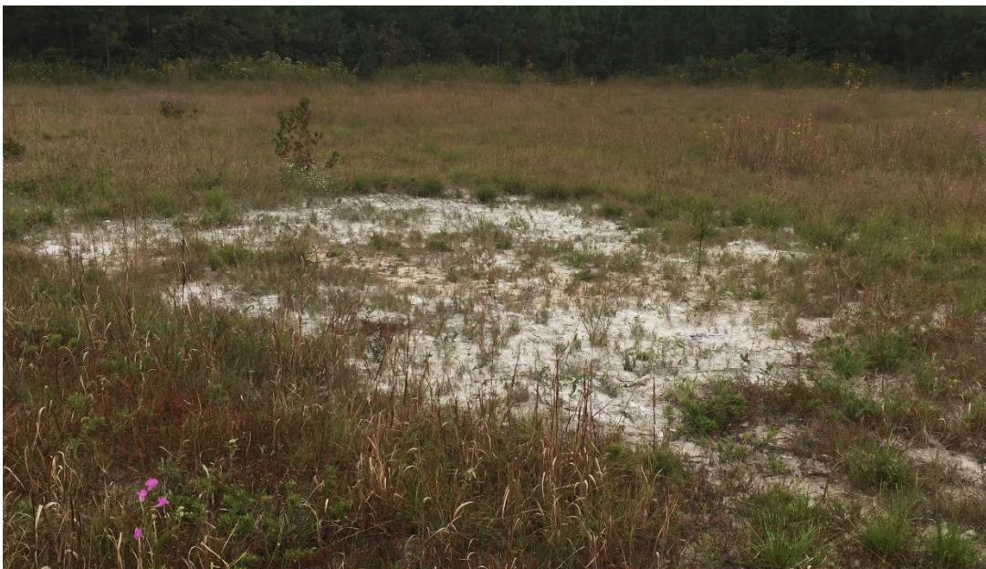
Figure 15. 32 tons per acre paper application rate after two growing seasons. The rate was too high to effectively incorporate into the soil, resulting in a thick soil covering that prevented plant growth.