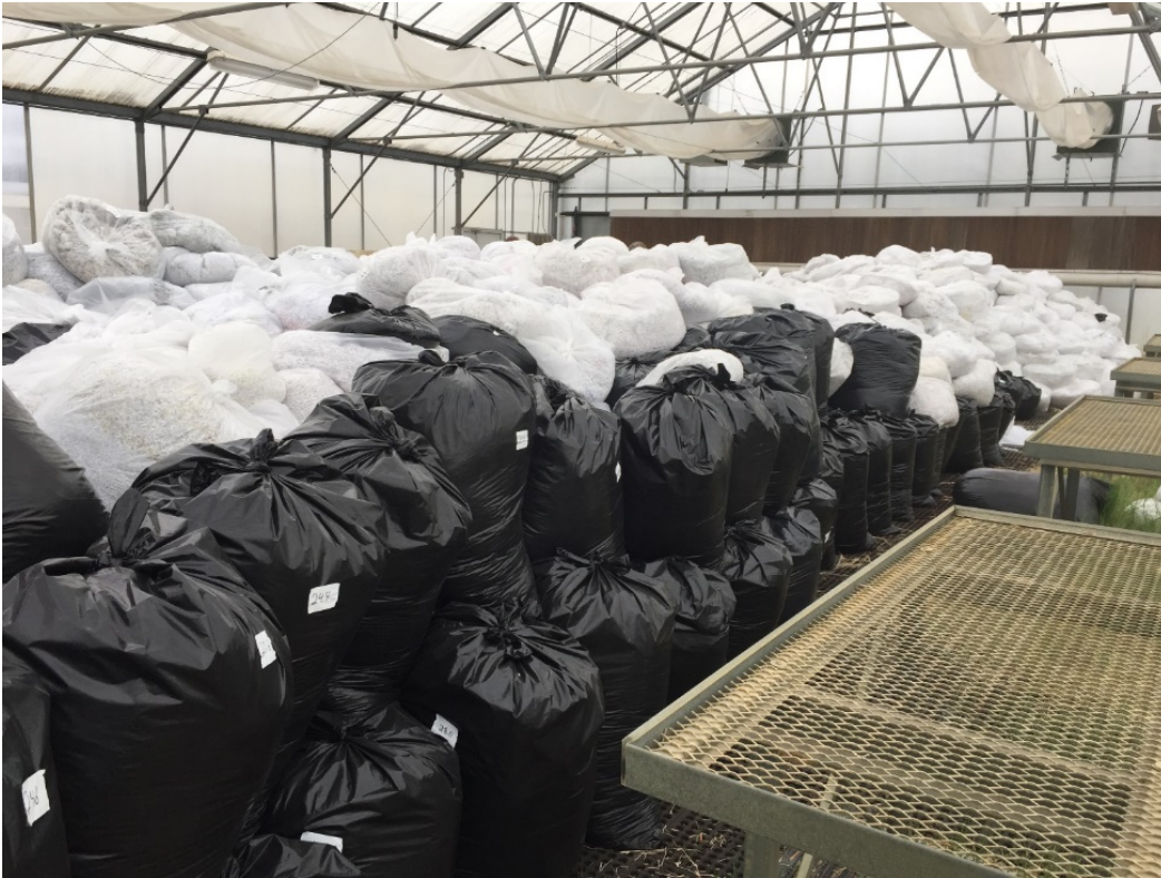
Figure 5. Bagged and weighed paper. Paper was stored in a greenhouse prior to transport to the field sites.