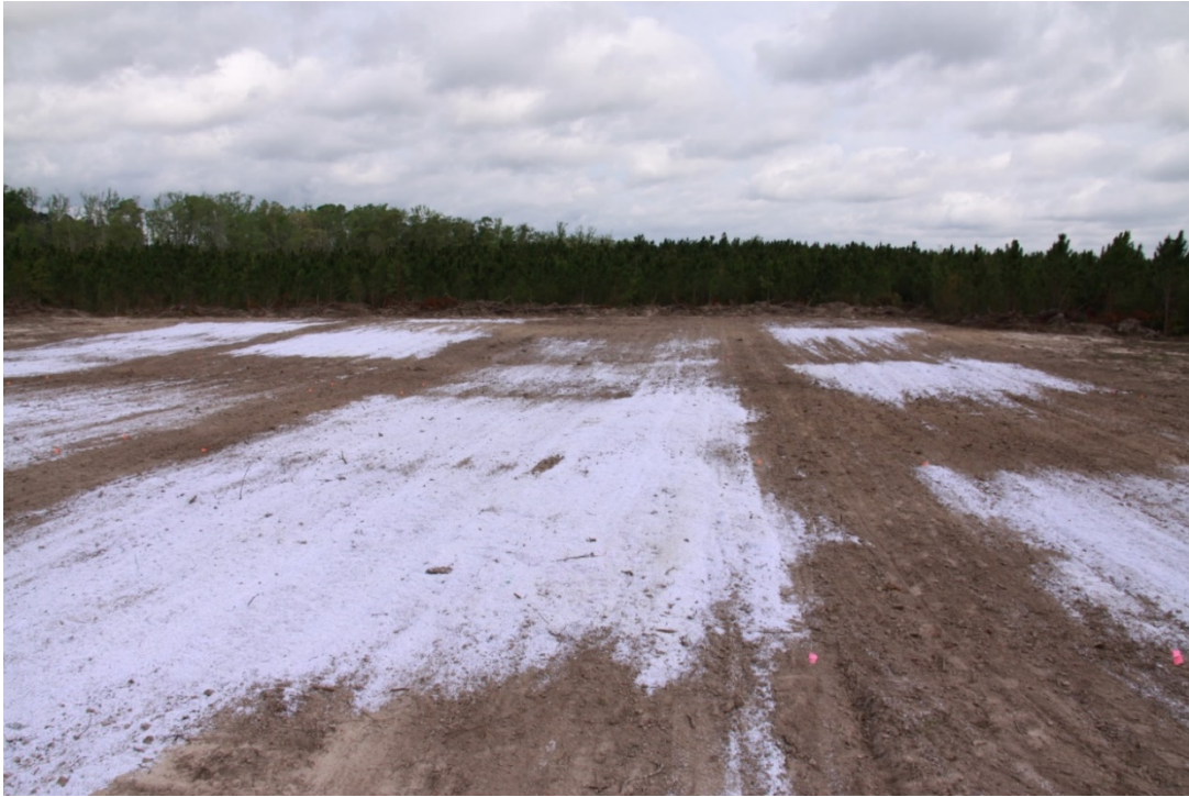
Figure 10. Pulverized paper demonstration plots. Plots consisted of a control, 8, 16, 24, and 32 tons per acre of paper application. The two highest application rates did not incorporate into the soil, but residual paper remained on the soil surface for all application rates.