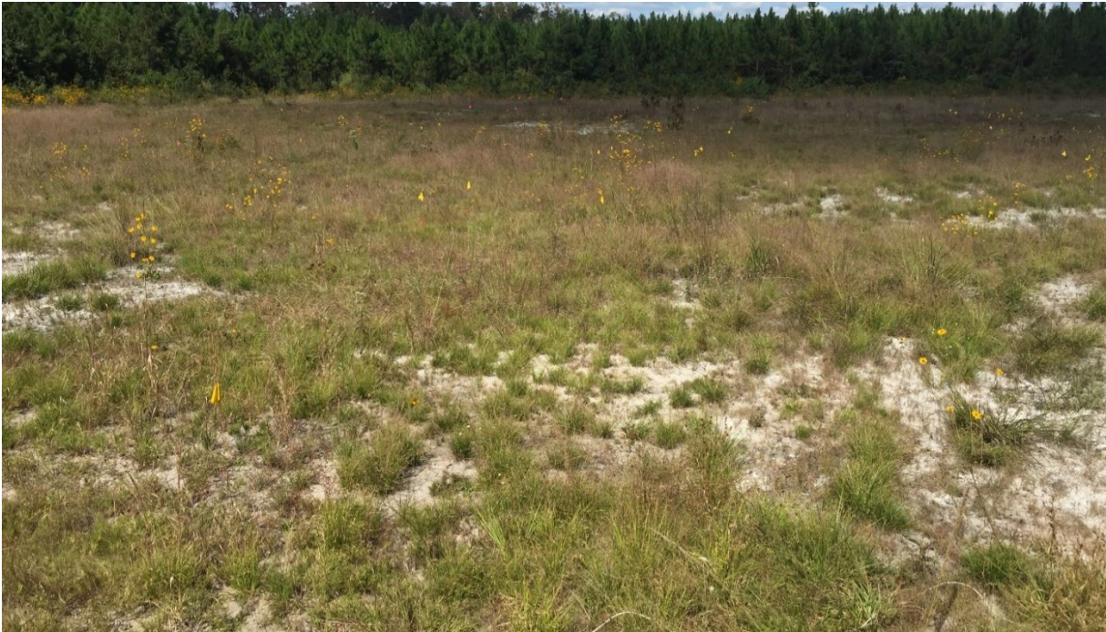
Figure 14. Vegetation establishment on paper application plots after two growing seasons.