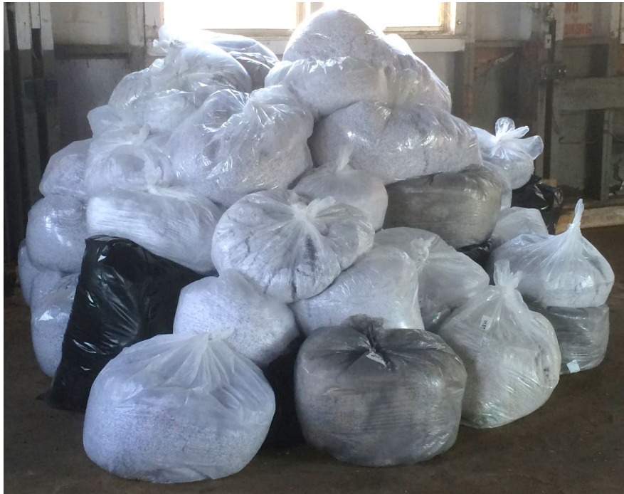
Figure 3. Batch-collected paper collected by a contractor. This batch was from multiple locations across Fort Polk and dropped off at the storage location when other recyclable materials were collected.