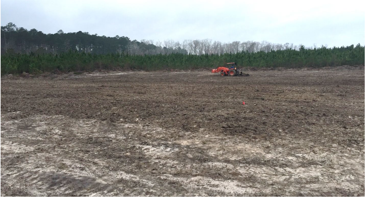
Figure 6. Initial site preparation.