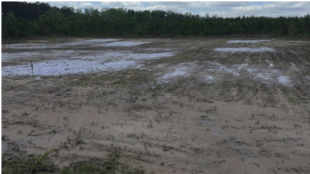
Figure 11. One month after incorporation of paper. Paper did not move from the locations where it was applied.