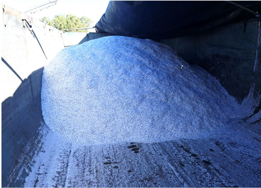
Figure 2. Approximately 1 ton of pulverized paper in a rented 20 cubic yard rolloff container.