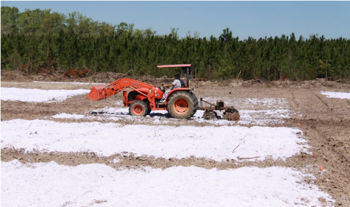
Figure 9. Paper incorporation using a compact tractor with disk.