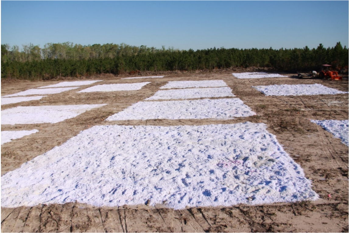
Figure 8. Paper is spread evenly over plots. Plots contained varying application rates.