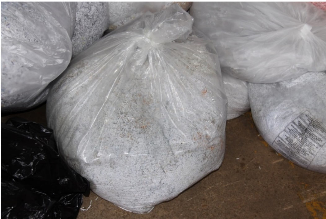
Figure 4. Close-up of a small batch-collected waste paper source.

Paper storage should be in a location where it is easily accessible with large equipment for drop off and pick up. An open-air pile would negate the use of plastic bags for storage and multiple roll-offs or other large volume containers. However, the risk exists for blowing of the paper into the surrounding area. Although this poses no hazard, it could create an eyesore and end up in areas where it is not desired. Wetting the pulverized paper causes it to stick together. This can be utilized to create a crust over open air piles to prevent movement. However, too much moisture would be detrimental, as the paper would be too sticky to easily spread, would weigh much more, and would begin to decompose and give off a musty smell. The best option for storage would be to utilize an existing bulk material bin or shelter similar to how construction materials and road salt are stored. This way the material is protected from moisture and wind and is accessible by large equipment. Covering paper piles with tarps could also be employed. However, any protected location where blowing paper can be contained and exposure to moisture could be minimized and managed would be suitable. Keeping a record of estimated paper mass or conceiving a means to estimate accumulated mass would be useful for future determinations of coverage for soil application and logistics.