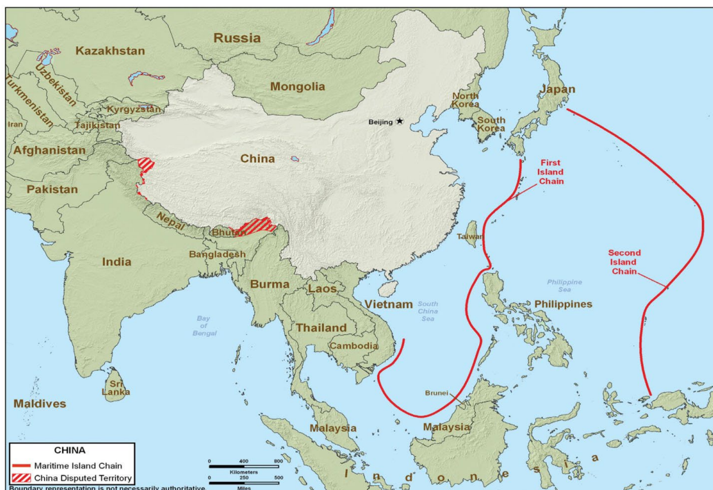
Figure 2. China's First and Second Island Chains. Map from Department of Defense, Military Power of the People's Republic of China 2008 , 25, http://www.lib.utexas.edu/maps/middle_east_and_asia/china_military_power_2008.pdf .

Subi Reef is the largest of seven man-made outposts in the Spratlys. Subi was built primarily in the first nine months of 2016 and boasts nearly 400 individual buildings. Subi is capable of hosting hundreds of personnel and has the potential to take the shape of a Chinese administrative hub. China may attempt to solidify its Nine-Dash Line claim with a civilian presence, security analysts, and diplomatic sources. 160 Mischief Reef and Fiery Cross Reef have almost 190 buildings and structures each. The satellite images also show up to sixty South China Sea features occupied by other nations as well, including Vietnam, Taiwan, and the Philippines. Although some islands show well-developed structures, these developments are nothing in comparison to Chinese militarization of the Spratlys. 161 Prior to these developments in the