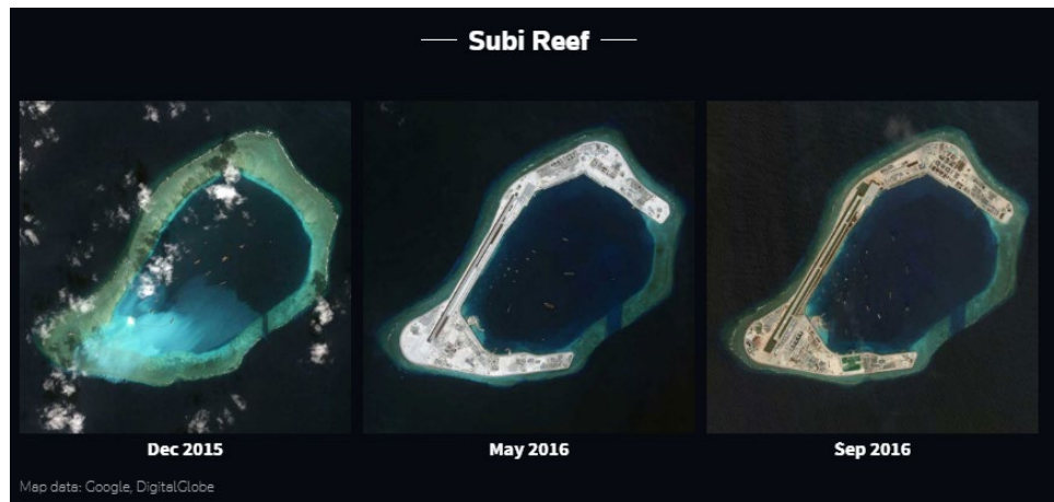
Figure 3. Subi Reef Development Progression Dec 2015 to Sep 2016.

This event became known as the Scarborough Shoal standoff. 162