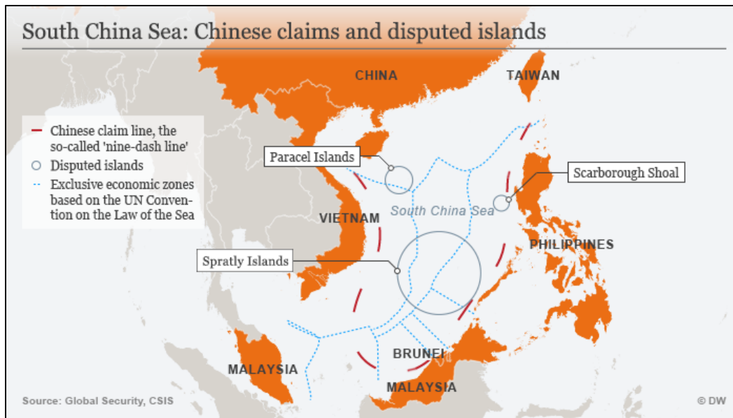
Figure 1. South China Sea: Chinese Claims and Disputed Islands. Map from Deutsche Welle, “South China Sea - What You Need to Know,” Deutsche Welle , last modified November 8, 2017, accessed March 21, 2019, https://www.dw.com/en/south-china-sea-what-you-need-to-know/a-40054470 .

In the 2018 NDS, Secretary of Defense James Mattis identifies China’s predatory economics with its neighbors and active militarization of features in the South China Sea. 155 Many would argue that this situation is not very different from the United States’ use of Diego Garcia as a military base in the Indian Ocean. The purpose of this strategic base was not purely for military power projection. The strategic location provided a projection of political and economic influences in India and the Middle East. The US military power at Diego Garcia allowed the ability to intervene faster and more dominantly in the region, thereby adding to the overall stability of the region. 156