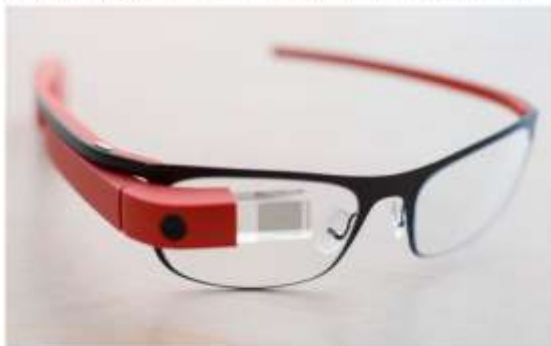
Human Robot Teaming for Unmanned Surface Vehicles