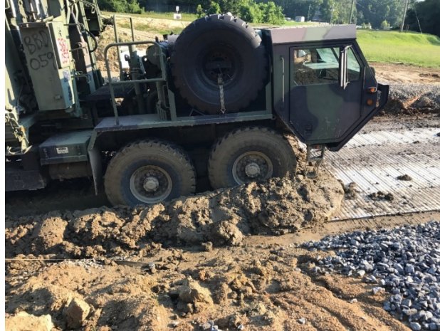
Figure 4. Testing slopes with mud placed on mats.