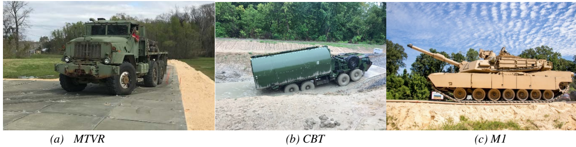
Figure 2. Test vehicles used in the study.