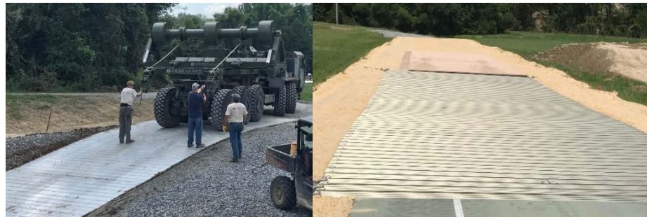
(a) Aluminum matting 1