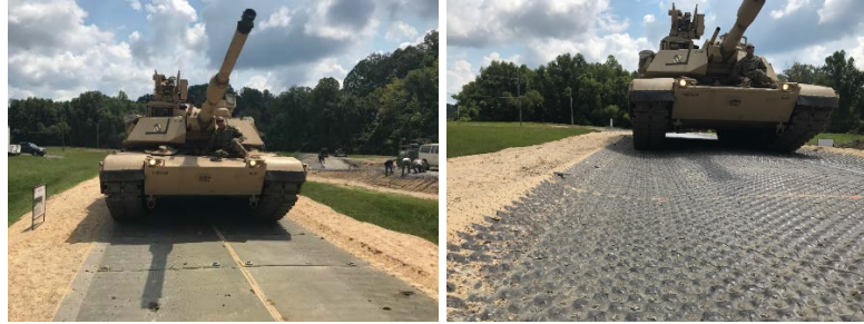
(d) Fiberglass matting 1 (e) Fiberglass matting 2 Figure 1. Matting systems evaluated for river bank stabilization.