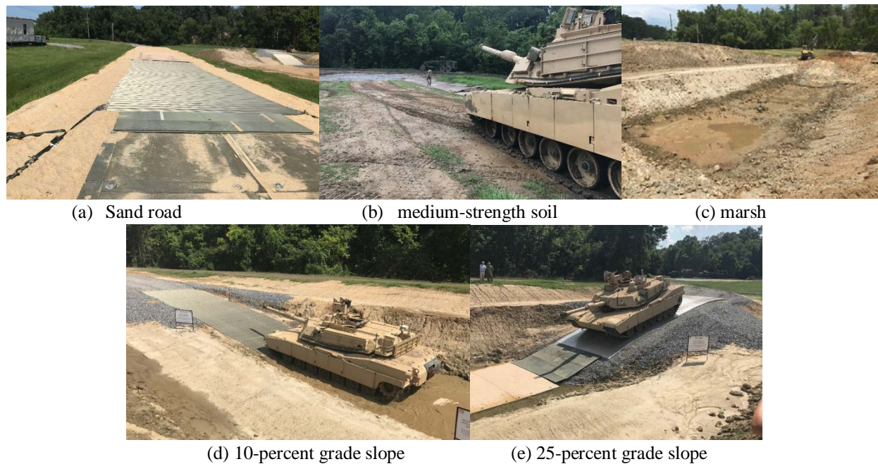
Figure 3. Site conditions used for testing.

Test conditions were specifically designed to represent a range of potentially problematic soils where matting would be required to support a large number of military ground crossings. These included varying soil types, strengths, and slopes. Figure 3 shows each of the site conditions used for testing. The following sections describe the test conditions used in this study.