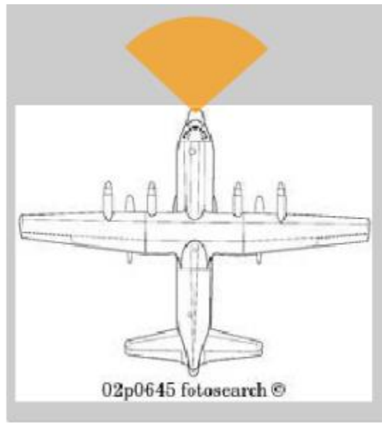
Figure 1: A comparison of the views from the crew stations of a C-130 (L) vs. the point of view using Google Earth (R).

One possible hardware configuration of the rehearsal system would consist of 5 VR “rigs” (a headset with headphones and microphone, along with hand controllers and a laptop computer) for the use of the four crew members and an “in VR” observer if needed or desired, plus an additional computer to handle inputting of information and generation of the simulation. Besides the mapping and other mission data, the additional computer would make sure all the crew an accurate view based on both their location in the aircraft and their head movements. All of this equipment would fit in one or two deployment ready cases, minimizing the unit’s additional deployment footprint.