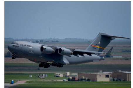
C-17 with door open on the flightline (top), and a KC-135 at takeoff (bottom).