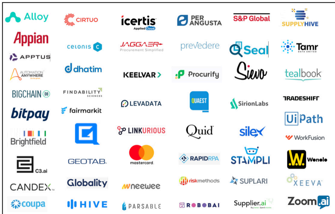
Figure 2. List of Artificial Intelligence and Procurement Startups

internal data for insights. Rapid RPA automates a customer’s business processes to enhance productivity (Echelon | RPA, n.d.). Other companies like Icertis, Sievo, and Seal are specific to procurement. Icertis is a bigger startup with a valuation of $1 billion (D’Onfro, 2019). It is a platform to manage the life cycle of contracting, from offers to negotiation, acceptance, and management. More specifically, it automates contract tasks and analyzes past negotiations (D’Onfro, 2019). Seal helps with contract management by helping their customers find the contracts quickly, extract critical data, and perform analytics (Seal Software, n.d.). Sievo provides contract management, spending analysis, and forecasting (Sievo, n.d.). Similar startups for artificial intelligence and procurement are growing.