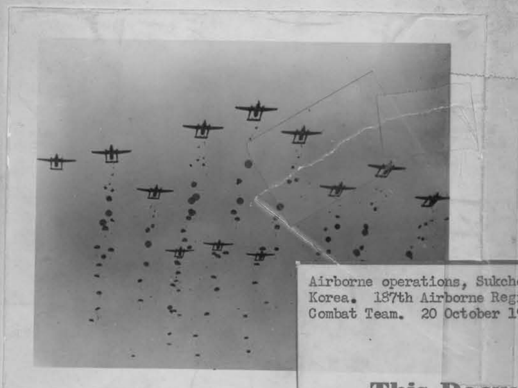
Airborne operations, Sukchon-Sunchon, Korea. 187th Airborne Regimental Combat Team. 20 October 1950.