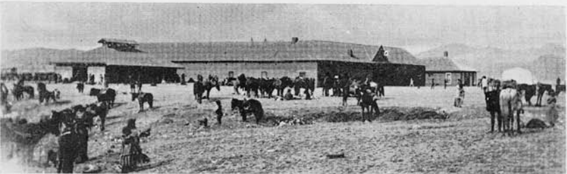
San Carlos Indian Agency, 1885.

The Apaches consisted of the Mescaleros and Warm Springs of New Mexico, of the Chiricahuas of southern Arizona and of the White