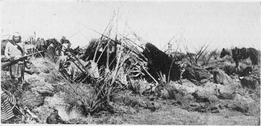
Geronimo's camp in Arizona, in the eighties. Sentinel has hammer of his gun pulled back to zero, ready for business.

(about 80 men, women and children) surrendered. The terms of the surrender, as arranged by Gen. Crook were disapproved and he asked to be relieved. (He was the greatest exponent of that time of the best way to civilize the Apache Indian as shown heretofore at San Carlos.) He was relieved and succeeded by Gen. Nelson A. Miles, April 20th 1886.