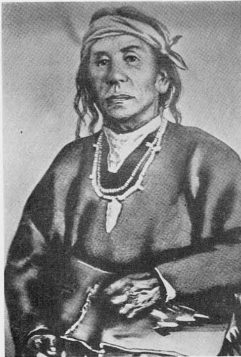
Cochise, Chiricahua Chief.

Such were General Crook's efforts to teach the Indians how to make a living and also how to preserve peace. He had complete control of the Apaches of central Arizona until John Clum took charge in 1874.