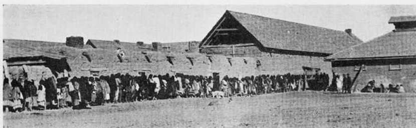
Indians drawing weekly rations, San Carlos, 1887.

The Indians were hard to manage, always hungry, and desirous of being served first. They began to assemble a day or so ahead of time for issue and took their places in line according to the time of arrival. Many times the scouts had to interfere to prevent moving up, and often an Indian had to be forcibly dragged from the line. The squaws were the worst offenders and, as each carried a butcher knife, were dangerous. Their resistance was such that frequently a scout had to use the butt of his gun to subdue the offender who finally was landed in the guard-house. The issue of beef was at first on the hoof, but the Indians in running down and killing the cattle created such a commotion, the butchering was so badly done and the whole process so barbarous, that this method of issue was stopped, and the cattle slaughtered by regular butchers and issued as dressed beef. However, the wilder Indians appeared to enjoy the old method, and the squaws and children enjoyed eating the entrails. As the rations were usually consumed as soon as issued the Indians were for the most part without food and eager for another issue.