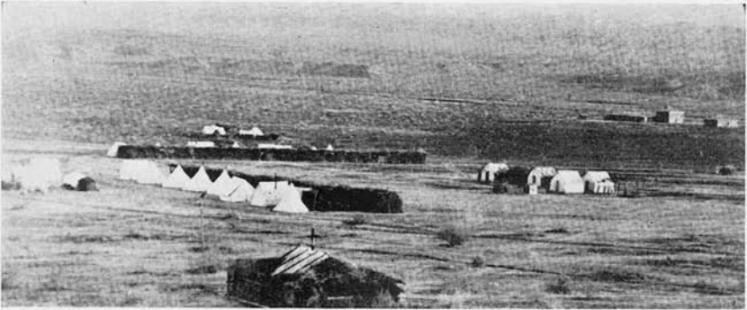
East half of San Carlos, Indian school in right background.

On March 3, 1849, the Department of the Interior was created and the Bureau of Indian Affairs was transferred to it and the control of Indian matters passed from the military to the civil branch. In 1870 the location was known as the "Rancheria San Carlos." A special agent was appointed for San Carlos and Camp Grant, in 1872, which was continued in 1873 when a sub agent was appointed. The Agency was established in 1873.