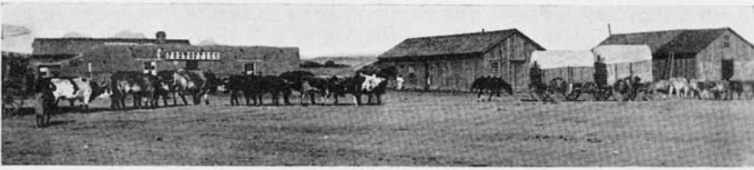
Indian trading stores, San Carlos.

was left. It is not known how he came to his death. Many stories were told but no one was able to claim the reward.