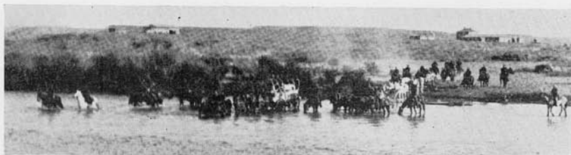
Troop G, 10th Cavalry, taking Indian prisoners to Tucson for trial before U. S. Court, 1886.

An ice machine was sent out by the Medical Dept. for use of the camp. No funds were sent to cover the cost of setting it up. The Quarter-