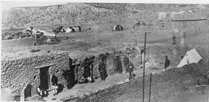
Interior of Guard House, San Carlos, 1885.