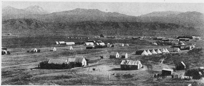
View of San Carlos, looking south.

Under the Interior Department after the Mexican cession of Territory, from time to time, 1849 to 1865, San Carlos was included in the "Indian Superintendency of New Mexico," and later about 1865 after the Gadsden Purchase, in that of Arizona. (This was discontinued in 1872.) When the War Department was created, August 7, 1789, the duty was imposed of "Handling Indian Affairs." The Commissioner of Indian Affairs was created in the War Department July 9, 1832.