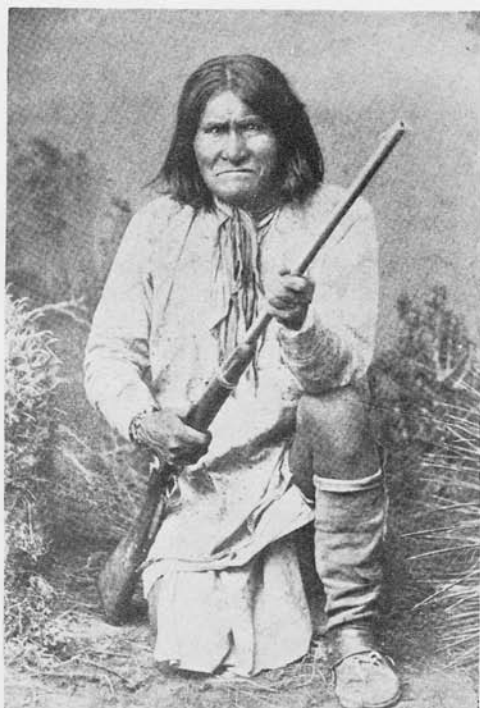
Geronimo, Chiricahua Apache War Chief. Photographed in 1885 before his escape in March, 1886.