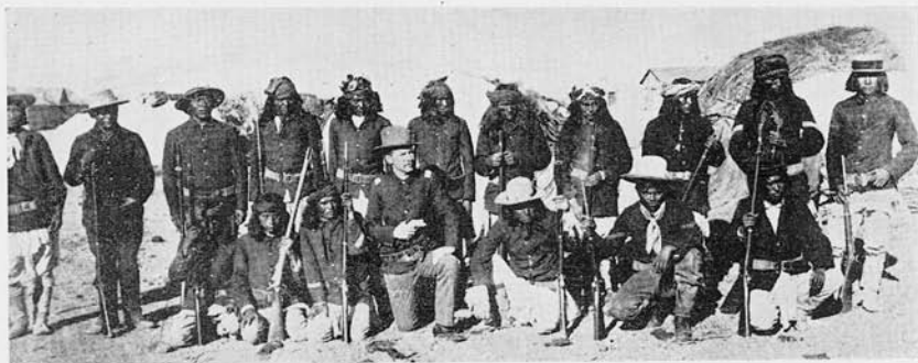
Apache Scouts, San Carlos, 1887.

der. The Indians also made intoxicating liquor (Tiswin† and Mescal‡, forbidden by General Crook) which started them dancing and led to disturbances and depredations. The Indian Police and Indian Scouts established by Gen. Crook were still in force. The Indian Scouts as shown in a later photograph were a part of the command and under the command of an army officer. They were mounted, furnished their own mounts and received $60 a month and a ration. The U. S. furnished them with arms and ammunition.