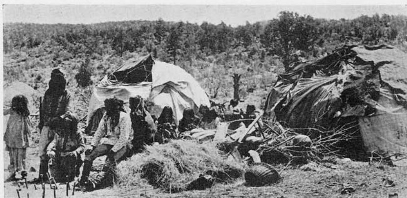
White Mountain Indian tepees, 1888.

The Indians were hard to manage, always hungry, and desirous of being served first. They began to assemble a day or so ahead of time for issue and took their places in line according to the time of arrival. Many times the scouts had to interfere to prevent moving up, and often an Indian had to be forcibly dragged from the line. The squaws were the worst offenders and, as each carried a butcher knife, were dangerous. Their resistance was such that frequently a scout had to use the butt of his gun to subdue the offender who finally was landed in the guard-house. The issue of beef was at first on the hoof, but the Indians in running down and killing the cattle created such a commotion, the butchering was so badly done and the whole process so barbarous, that this method of issue was stopped, and the cattle slaughtered by regular butchers and issued as dressed beef. However, the wilder Indians appeared to enjoy the old method, and the squaws and children enjoyed eating the entrails. As the rations were usually consumed as soon as issued the Indians were for the most part without food and eager for another issue.