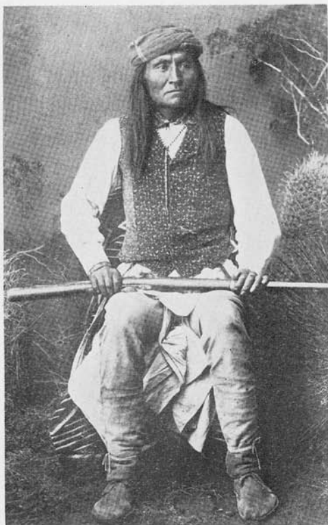
Mangas, Chiricahua Chief.

Mountains, Tontos, Mojaves, Pinals and Haulpis of central Arizona who crossed and recrossed the San Carlos reservation and camped on this strip of land. (The Navahoes and Moquis of Northern Arizona were of the same great family.) The Apaches had been waging war with the provinces of Chihuahua and Sonora Mexico for generations. Warfare with the Americans who entered this territory which the Indians considered their own, was begun 1860 and lasted nearly 40 years. These Indians camped in bands or tribes up and down the San Carlos and Gila rivers. They were not farmers and depended on hunting, raids, robbery, pillage and the warpath for a living. They had little stock except ponies and burros. (Mongrel dogs were numerous.) The Apaches were physically strong, brave, fearless, savage, treacherous, cunning, superior scouts and a formidable people to subdue and civilize. They developed some famous raiders. Mangas Coloradas, Cochise, Victorio and Geronimo were the best known.