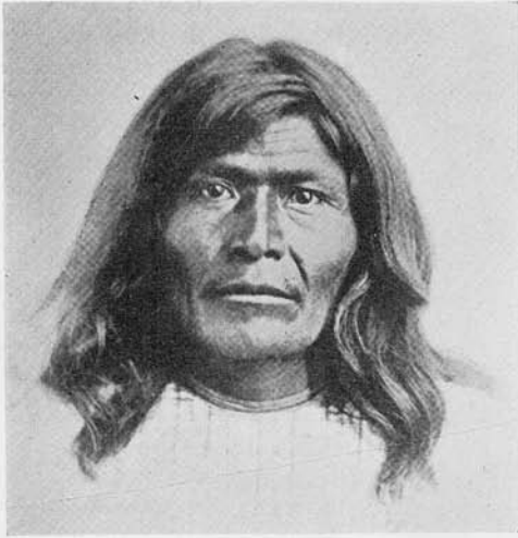
Victorio, Apache Chief.

Chiricahuas had been on the warpath during 1879 and 1880 in New Mexico, encouraged the Indians at San Carlos in their discontent and turbulence. In 1880 Victorio, angered by Indian Scouts from Arizona fighting against him, decided to revenge and later sent a small band to San Carlos which succeeded in killing several Indians and escaping. Victorio was killed in Mexico in December 1880.