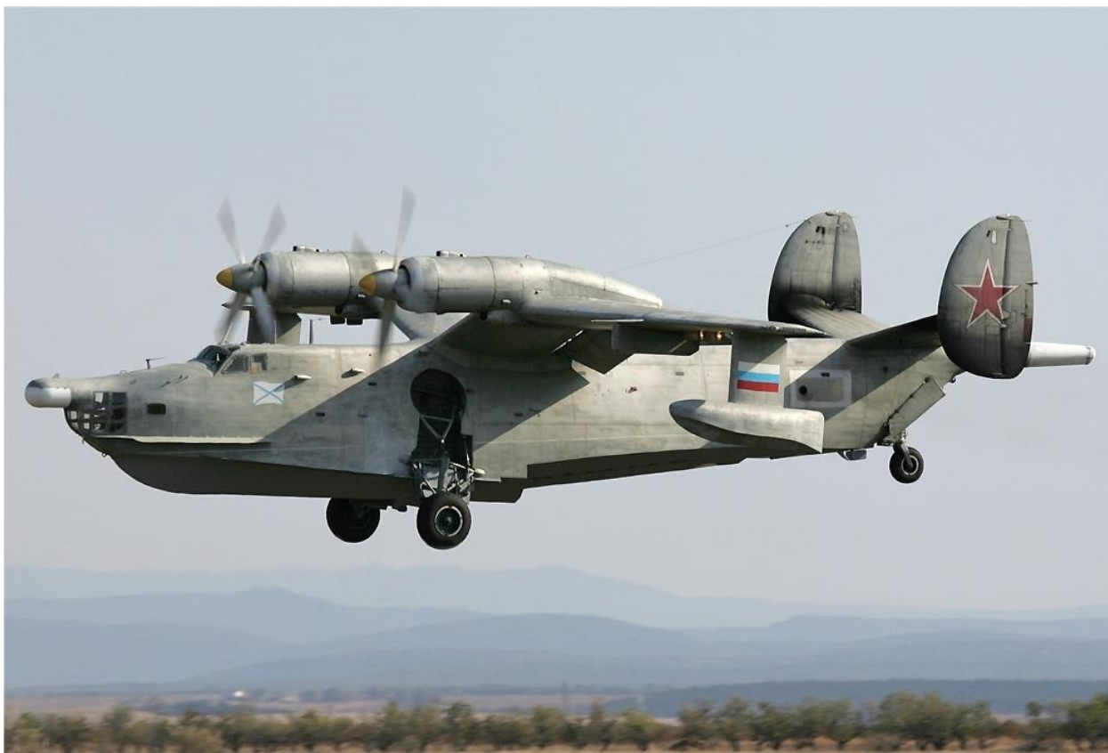
The Be-12 amphibious aircraft. See: Wikimedia Commons, https://commons.wikimedia.org/wiki/File:Russian_Navy_Beriev_Be-12.jpg .