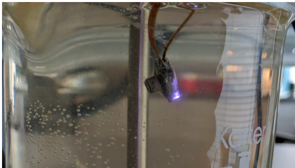
Testing of Waterproofing

What opportunities for training and professional development has the project provided?