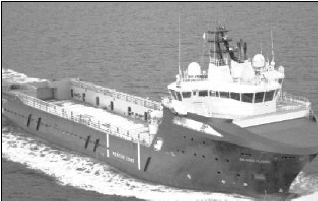
Figure 5. Platform Supply Vessel.

The PSV is a generic name for a vessel designed primarily to provide logistic support to offshore oil or gas platforms. The backbone of the offshore supply chain and like the original OSV design, PSVs normally have a large open deck aft for containers and large support equipment and internal bulk liquid tanks for fuel, potable water, and dry bulk. These vessels generally range in size between 50 meters (165 feet) to 100 meters (330 feet) in length and are designed to stay out at sea for up to 7 days (Rose, 2011). Figure 5 depicts a typical PSV.