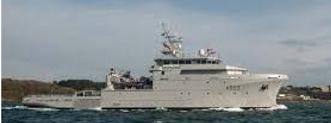
Figure 7. French Navy Offshore Support Vessel Rhone .

vessel, and it can accommodate up to 24 passengers. The 2,700-square foot cargo deck provides storage for weapons, ammunition, and shipping containers (Naval Today, 2018).