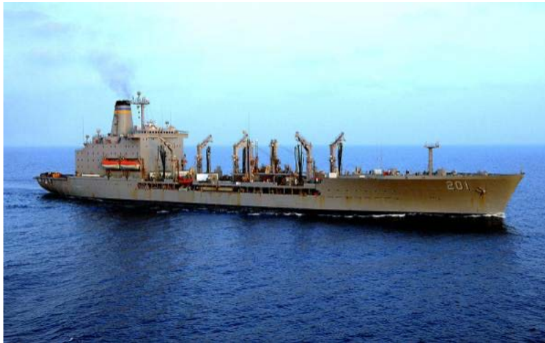
Figure 1. USNS Patuxent (T-AO 201).

For the U.S. Navy to be effective over extended periods at sea, replenishment at sea (RAS) is critical. Since World War II, the modern-day Military Sealift Command (MSC) has fulfilled this role. The Navy's CLF operates various ships to provide logistic support to deployed U.S. Naval combatants and coalition forces ships. The CLF is foundational to extending the U.S. Navy's culmination point afloat by resupplying bulk fuel, ordnance, food, repair parts, and other various classes of supply. Without the CLF, maritime sustainment would rely on friendly ports, thus limiting their power projection (Wakim, 2019). The CLF is currently made up of 29 auxiliary ships that are operated by U.S. Government Civil Service Merchants. The CLF is comprised of three different types of ships: fleet replenishment oilers (T-AO; Figure 1), dry cargo and ammunition Ships (T-AKE; Figure 2), and fast combat support ships (T-AOE; Figure 3).