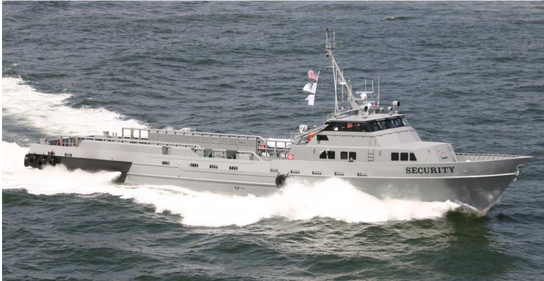
Figure 6. Fast Supply Vessel.

varies depending on the size of the ship, but some manufacturer's options include up to 1,000 barrels of bulk liquid and up 3,000ft 3 of dry bulk materials. Passenger capacity ranges from 50 to 100 and is limited in duration where overnight accommodations are not usually offered (Rose, 2011). Due to their speed and versatility, the FSV has become an essential part of the logistics chain for offshore operations. Figure 6 depicts a typical FSV.