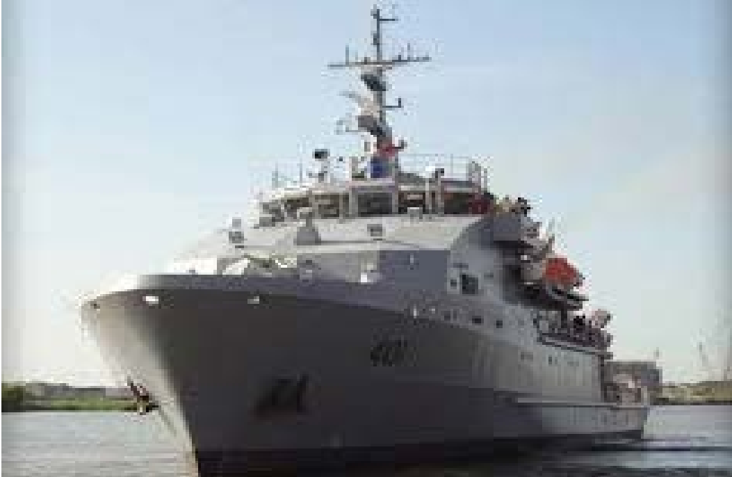
Figure 9. OSV 401 Al Basra .