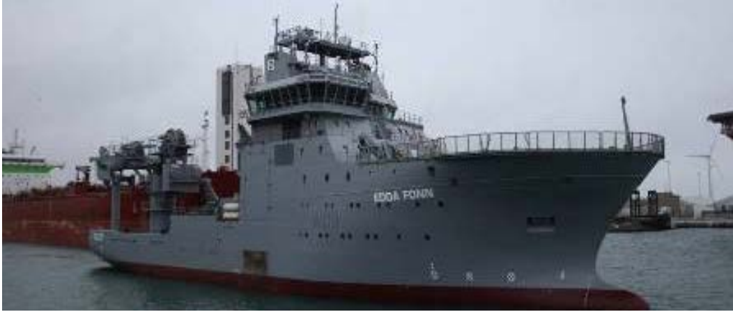
Figure 8. HMNZS Manawanui .