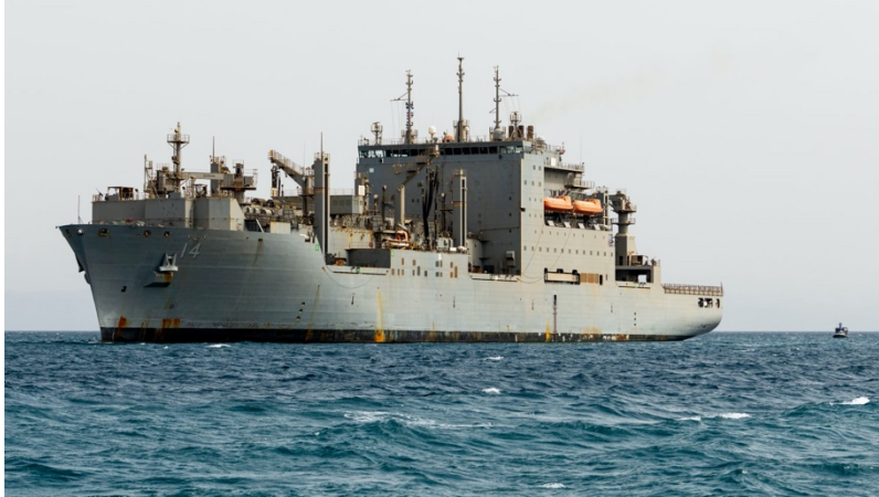
Figure 2. USNS Cesar Chavez (T-AKE-14).