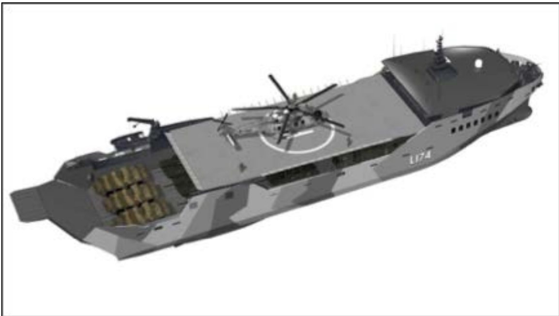
Figure 10. Light Amphibious Warship.

While the design of the LAW is still under development , many of the key elements have been identified. The new LAW program has been originally presented as a 28- to 30-ship addition to the current amphibious fleet. The key design elements identified by the U.S. Navy and Marine Corps will result in a vessel measuring from 200 to 400 feet and crewed by 40 personnel (Congressional Research Service, 2020). The ship will be able to transport 75 Marines at a minimum and have the cargo capacity to transport up 8,000 square feet of weapons, supplies, and equipment. The defensive weaponry organic to the LAW will come from a 25mm or 30mm gun system and multiple .50 caliber machine guns (Congressional Research Service, 2020). The minimum speed and range requested were 14 knots and 3,500 nautical miles, respectively. Lastly, the LAW differs from many of its close relatives in the beach- able family of ships in that it will be designed either to operate as an addition to a fleet group or to deploy independently. Figure 10 depicts an artist’s rendering; however, the actual design could differ from this (Congressional Research Service, 2020).