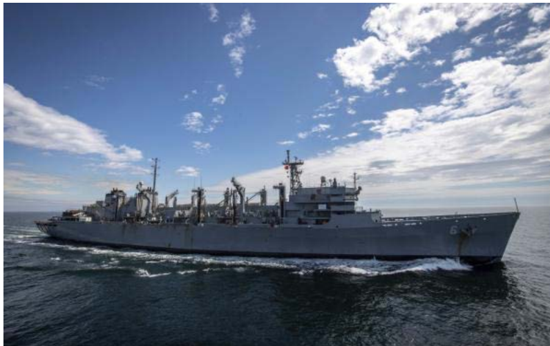
Figure 3. USNS Supply (T-AOE 6).

According to Navy and MSC officials, a greater reliance on distributed operations and the lethality provided by a widely distributed fleet will require resupplying ships that are farther apart and generally increase the demand on the combat logistics force. This stands in contrast to the Navy's traditional concept of operations, in which Navy combatant ships operate in task group formations—such as carrier strike groups or amphibious ready groups—and to support these formations, combat logistics force ships transit with them and replenish them with supplies as needed. (Pendleton, 2017)