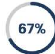
Figure 2 Business impact of privacy Percentage of companies getting significant benefits in each area, N=2549