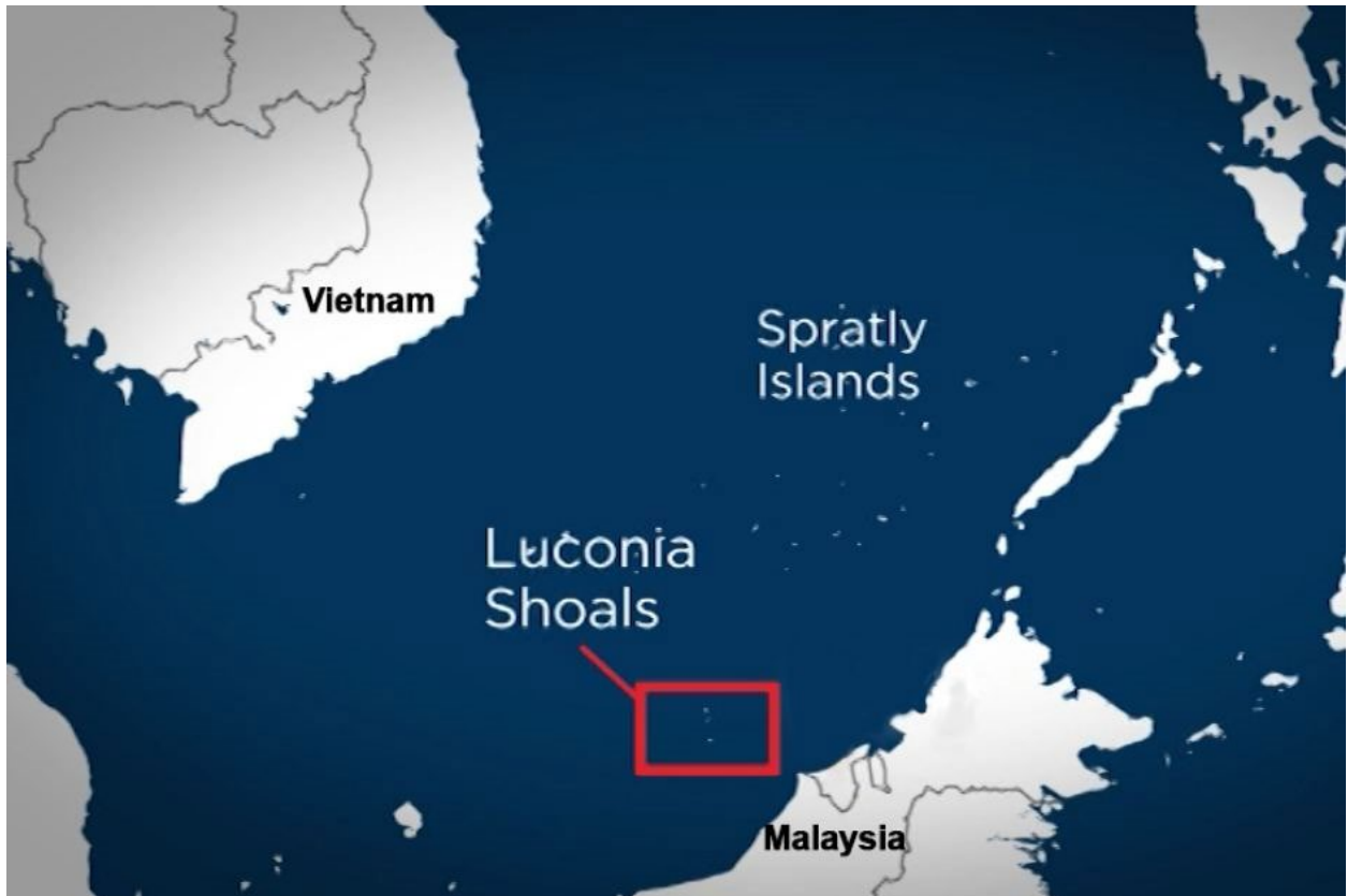
Figure 3. Map of Luconia Shoals. 123

The Luconia Shoals are known to possess several natural gas and oil reserves that Malaysia has utilized for its own domestic energy purposes for several years. 124 In August of 2013, China began increasing its presence in the Luconia Shoals by completing several maritime patrols, culminating in a Chinese Coast guard vessel the Haijing 1123 dropping its anchor within the Luconia Shoals and maintaining its presence until November 2015. 125 However, despite China's assertiveness within the Luconia Shoals many responses from Malaysia's Najib administration were weak in responding to China's assertiveness in the South China Sea. For instance, Malaysia allowed Chinese Coast Guard ships to remain in