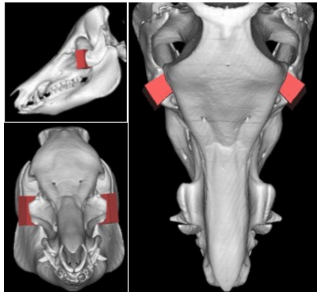
Figure 1. Isolation of VOI (volume of interest) i.e. the implant from the rest of the zygoma using the same wedge-shaped solid object (.stl) which was used for creation of the defect and respective implant design.

Post-surgery, CT scans were performed on the pigs of different groups at the designated time points as shown in Table 1. The scans were analyzed using Materialise Mimics software. Briefly, the raw CT Dicom files were imported into mimics and thresholding was done at 226 HU (Hounsfield Units). The 3D skull volumes at different timepoints were registered with the corresponding volumes at PostOp timepoint and the VOI (volume of interest), in this case the implant, was isolated using the same wedge-shaped solid object (.stl file) which was used to create the segmental zygomatic defect initially as shown in figure 1. Once the VOI was isolated, a mask was created from it and the volume of the mask (i.e. the volume of the voxels contained in the respective mask) was recorded as bone volume (BV) for the respective time point. The total volume of the defect was calculated by performing a “wrap” function on the isolated VOI from the pre-op CT of the animals (performed a few weeks before the surgery) and was recorded as total volume (TV) for the