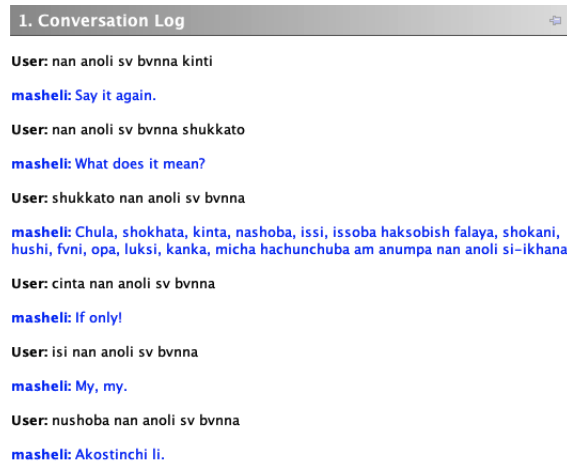
Fig. 4 Errors in user input in Choctaw