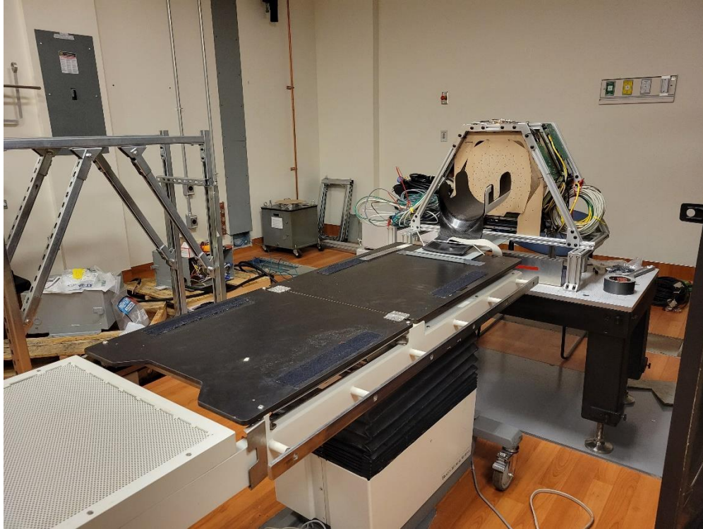
Figure 1. Stationary head CT components in the former clinical CT space at the UNC Hospital's Ambulatory Care Center. The x-ray detector assembly, head holder and patient bed are all positioned as intended for the imaging study. The x-ray tube holder frame is to the left of the imaging bed. Sterilizable patient pads will be attached with the Velcro pads.