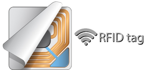
Figure 3. Sample RFID Tag.

demand basis. Data is received through the frequency waves emitted by the tags. This can be low or high frequency, again dependent on the environment in which the items are stored (Ferrer et al., 2010)