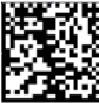
Figure 4. Sample Two-Dimensional Data Matrix.

MIL-STD-130N is the DOD-wide guidance for how to properly mark items and contains instructions for how to properly mark each item.