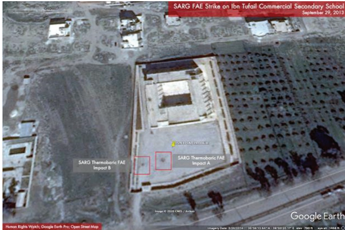
Figure A-2.1 SARG Fuel-Air Explosive Strike on Ibn Tufail Commercial Secondary School, September 29, 2013