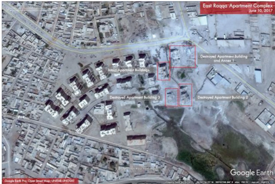
Figure A-5.5 East Raqqa Apartment Complex: The First SDF Assault, June 10, 2017