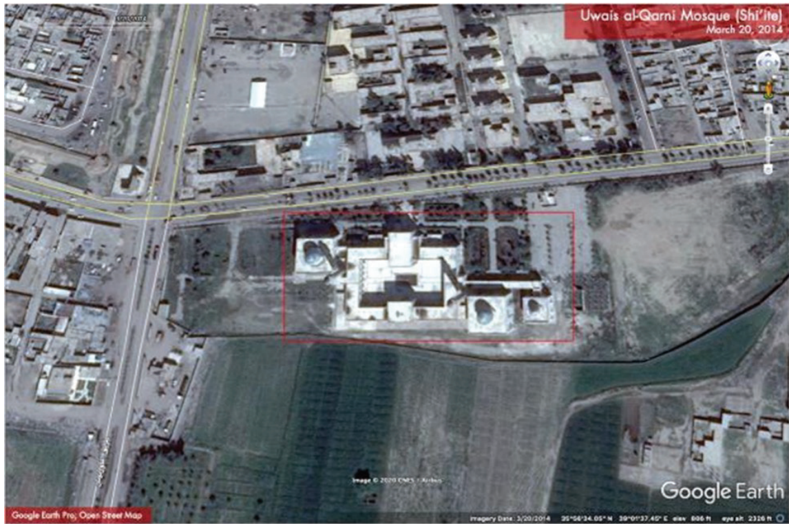
Figure A-3.1 Uwais al-Qarni Mosque, March 20, 2014