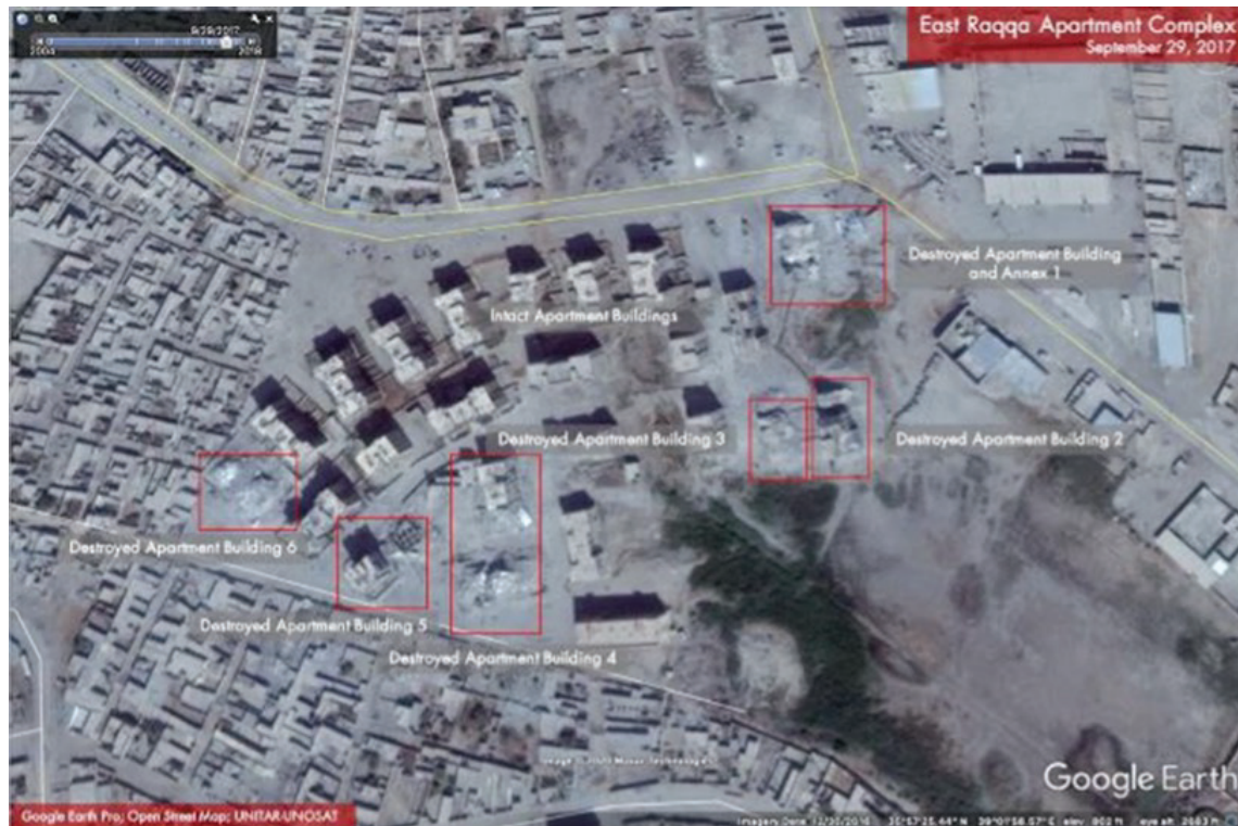
Figure A-5.7 East Raqqa Apartment Complex: Destroyed and Intact Buildings, September 29, 2017

SOURCES: Google Earth Pro, Maxar Technologies; OpenStreetMap.