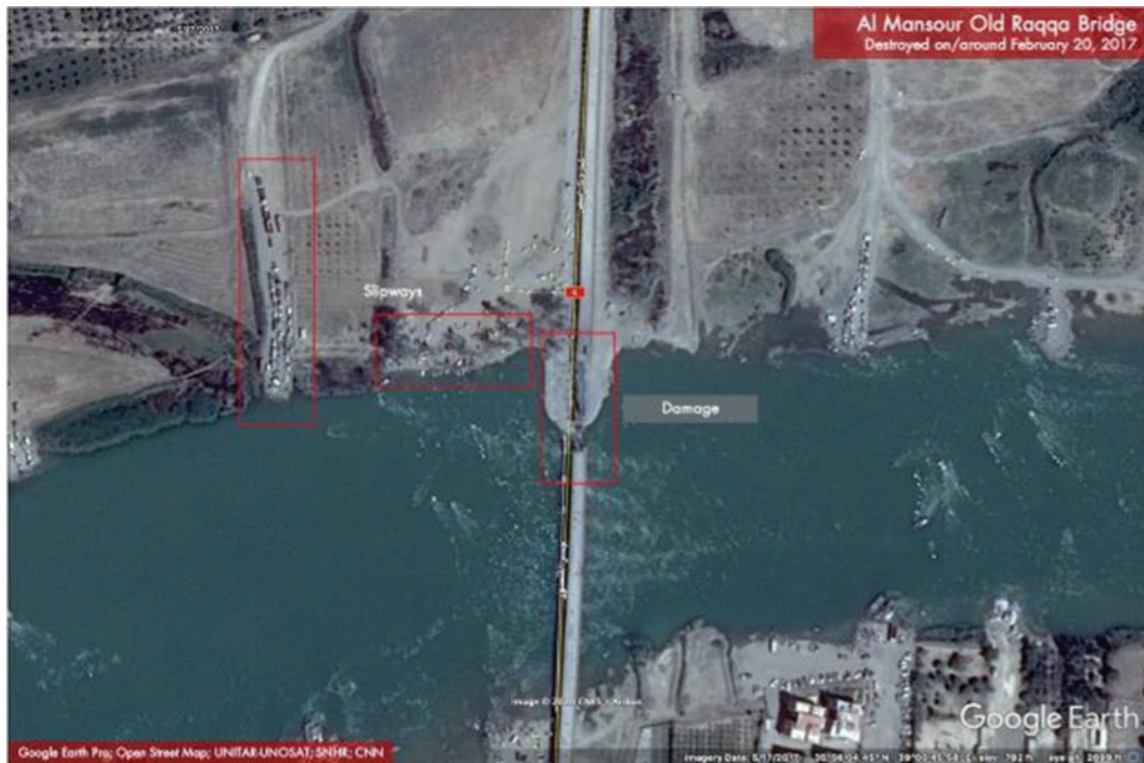
Figure A-4.1 Coalition Strike Damage to the Old Raqqa Bridge, on or Around February 20, 2017