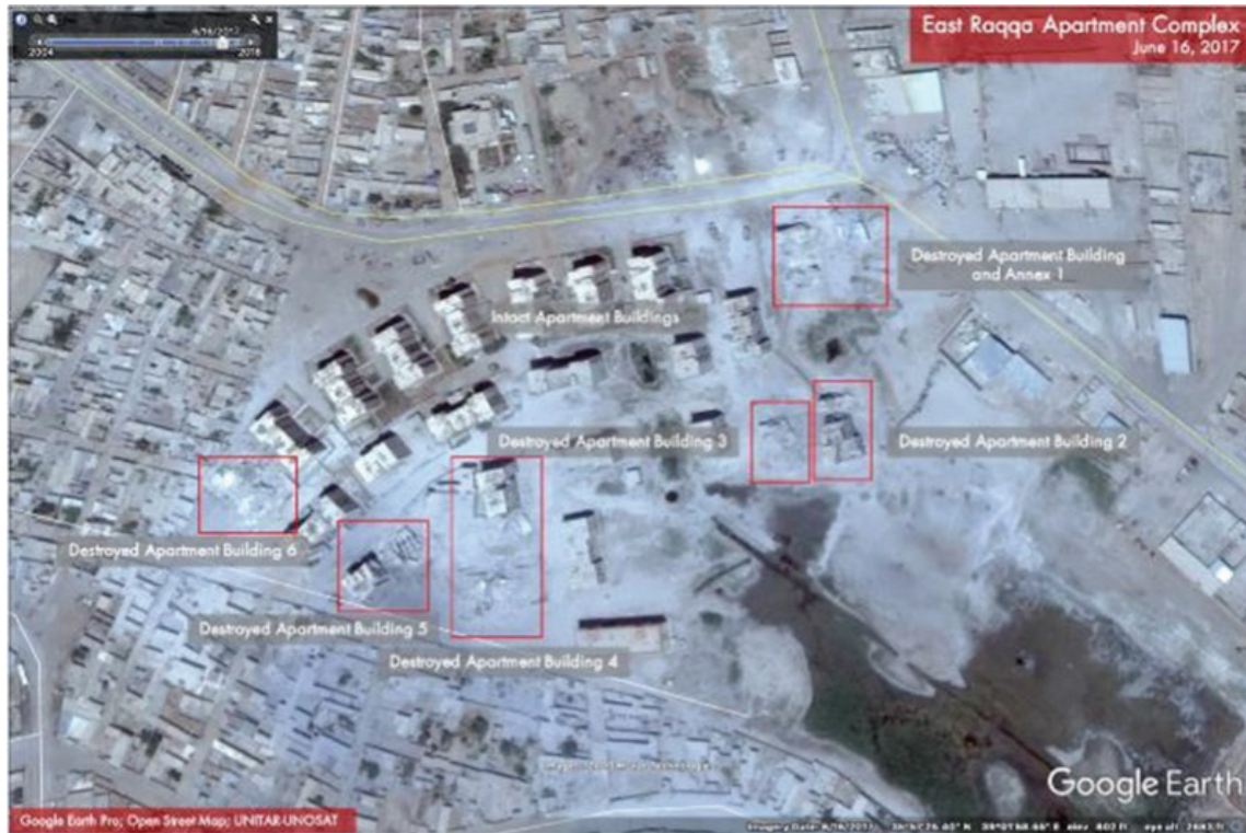
Figure A-5.6 East Raqqa Apartment Complex: Additional Targeted Damage, June 16, 2017