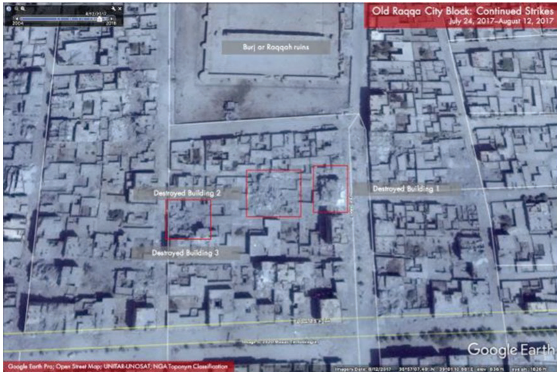
Figure A-5.10 Continued Targeted Strikes Supporting the SDF's Advance, July 24–August 12, 2017