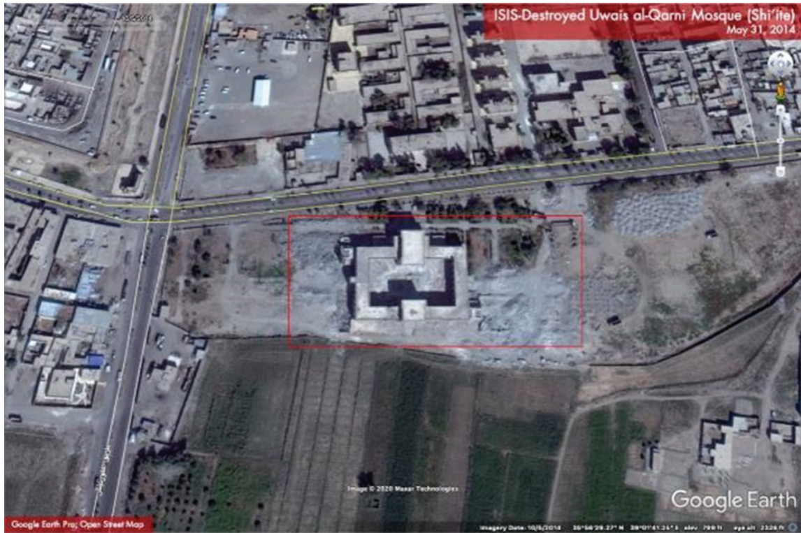
Figure A-3.2 ISIS-Destroyed Uwais al-Qarni Mosque, May 31, 2014