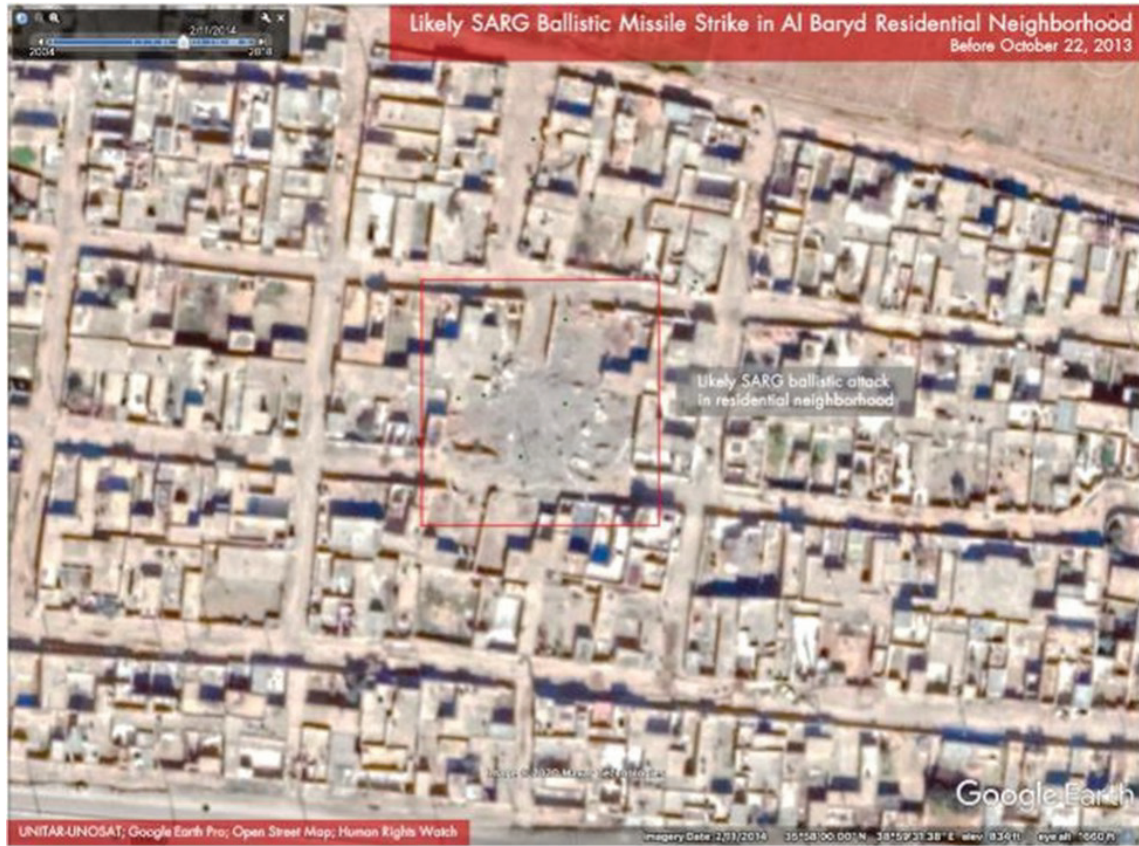
Figure A-2.2 Likely SARG Ballistic Missile Strike in the al-Baryd Neighborhood, Before October 22, 2013