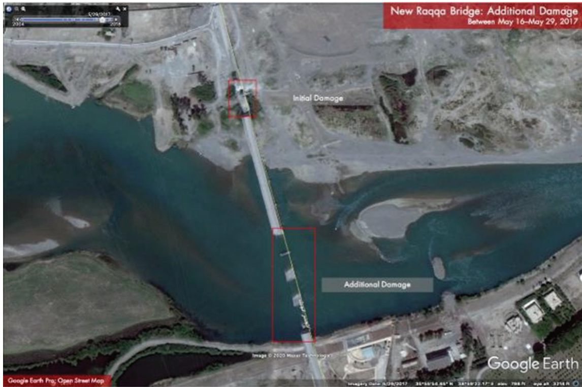
Figure A-4.2 Initial and Subsequent Strike Damage, New Raqqa Bridge, Between May 16 and May 29, 2017