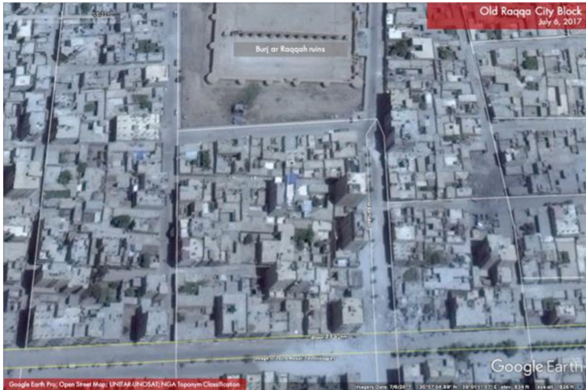
Figure A-5.8 City Block in Raqqa's Old City, July 6, 2017

SOURCES: Google Earth Pro, Maxar Technologies; OpenStreetMap.