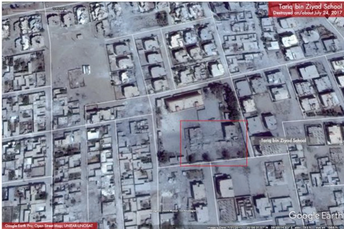
Figure A-5.2 Tariq bin Ziyad School, Destroyed on or Around July 24, 2017

SOURCES: Google Earth Pro, Maxar Technologies; OpenStreetMap.