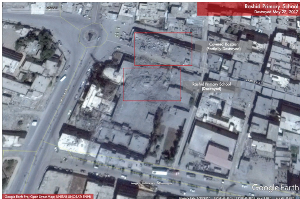
Figure A-5.1 Rashid Primary School, Destroyed May 27, 2017