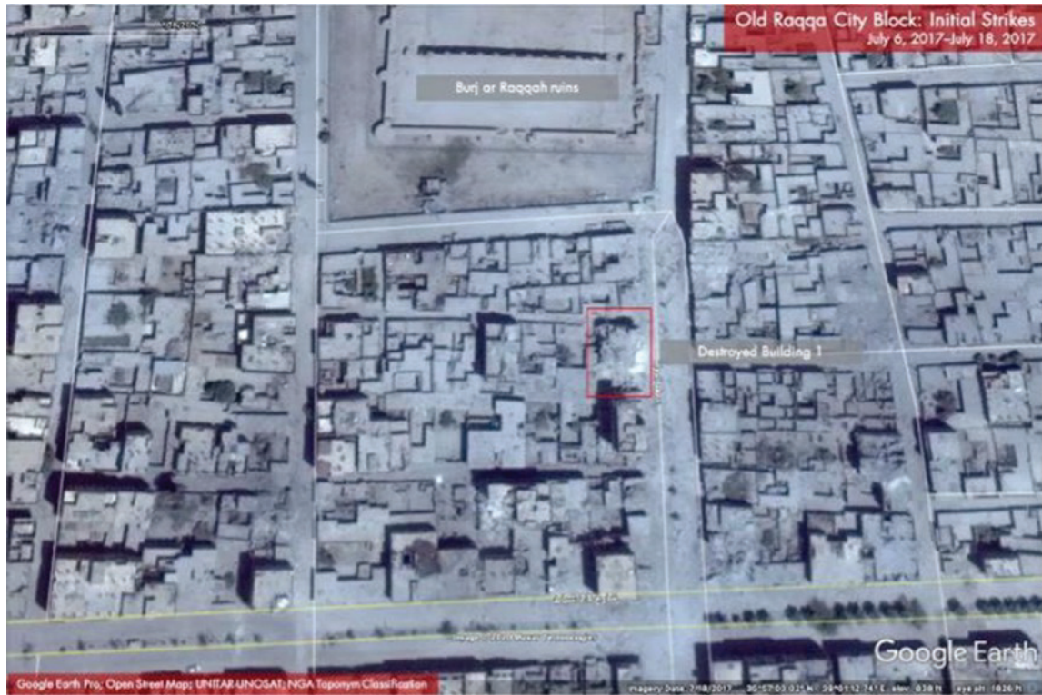
Figure A-5.9 Initial Targeted Strikes, July 5–18, 2017

SOURCES: Google Earth Pro, Maxar Technologies; OpenStreetMap.