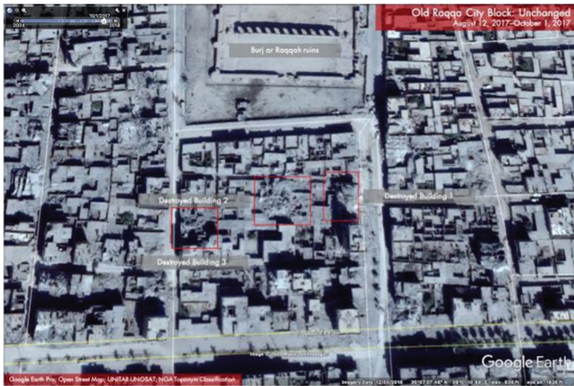
Figure A-5.11 City Block in Raqqa's Old City: Buildings Destroyed by Targeted Strikes Versus Buildings Damaged by Ground Fighting, August 12–October 1, 2017