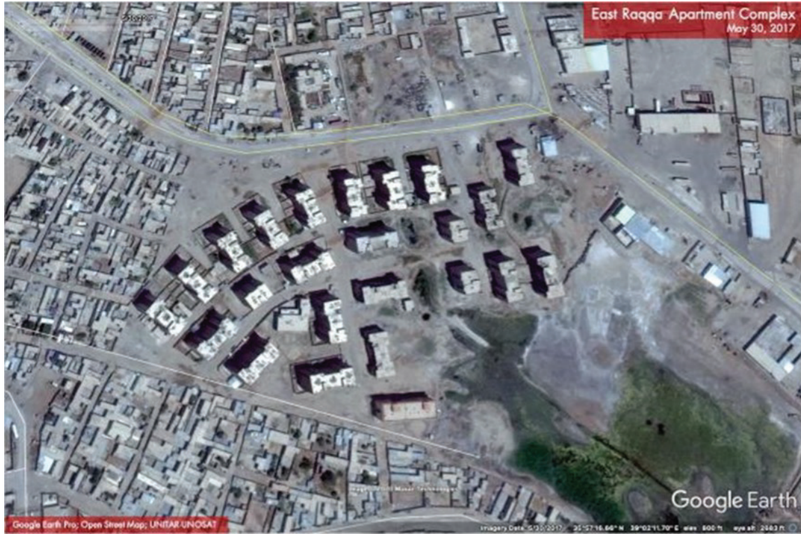
Figure A-5.4 East Raqqa Apartment Complex, May 30, 2017