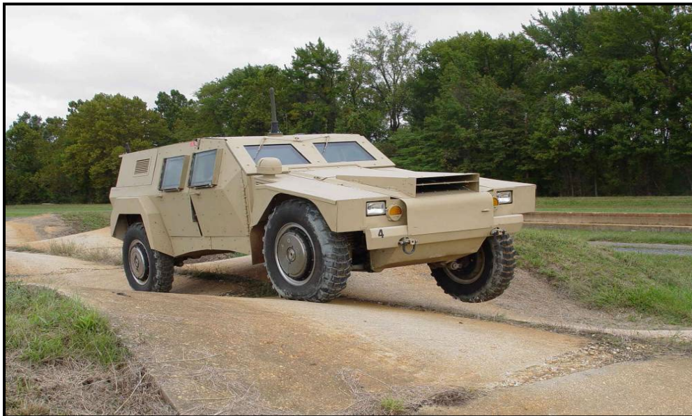
Figure 8. Vehicle negotiating wave course.

(1) Operate the test vehicle over the wave course (Figure 8) utilizing a reasonable range of speeds and gears.