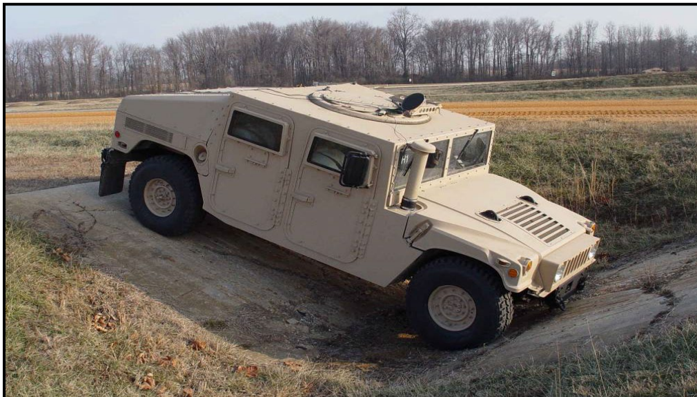
Figure 7. Vehicle negotiating standard trench.

Trench-crossing tests are conducted to determine whether a vehicle has angles of approach, departure, and ground clearance that are adequate to allow negotiation of an obstacle that has been accepted as a standard of comparison. The standard trench (Figure 7) has a concrete surface, but whenever insufficient traction occurs, i.e., steel tracks, an earthen ditch of the same configuration may be substituted.