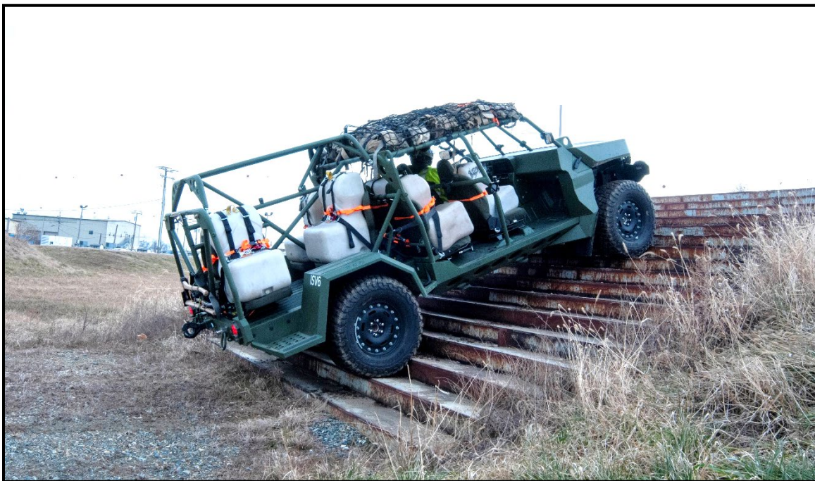
Figure 12. Vehicle negotiating the stair course at the ATC MTA.