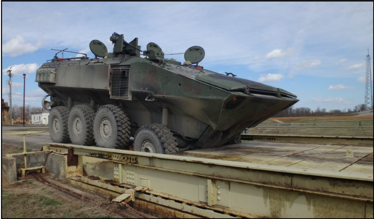
Figure 4. Multiple-axle wheeled vehicle negotiating bridging device.