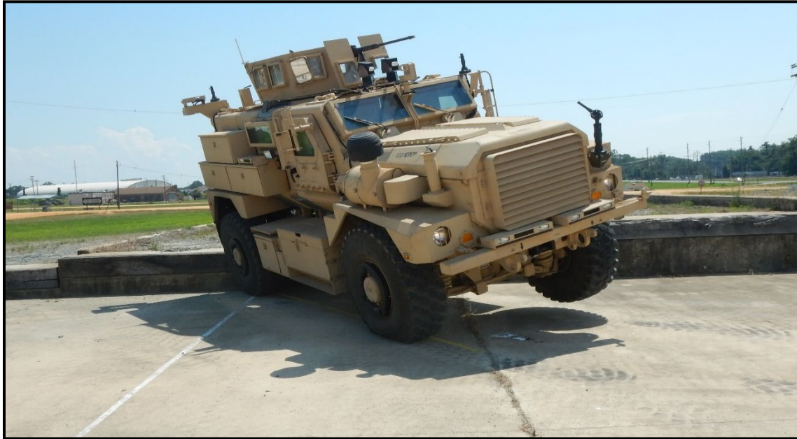
Figure 6. Vehicle ascending vertical wall in reverse gear at a 30-degree angle with wheel lift.