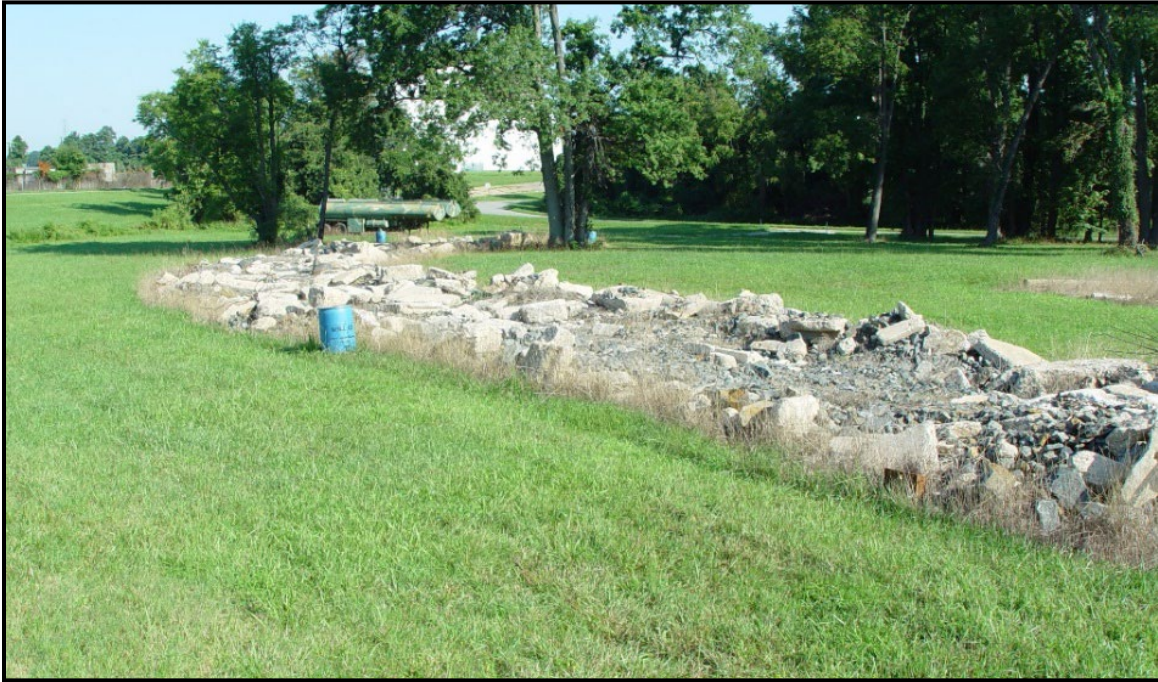
Figure 10. Rubble pile course.