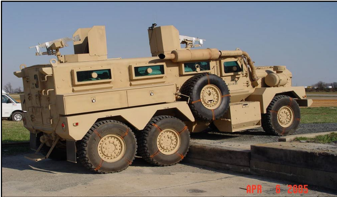
Figure 5. Vehicle ascending vertical wall.

c. When required, the test is repeated with the vehicle ascending the wall in the reverse gear and can also be repeated in the descending mode at wall heights equal to the maximum attained in the ascending mode in the forward gear.