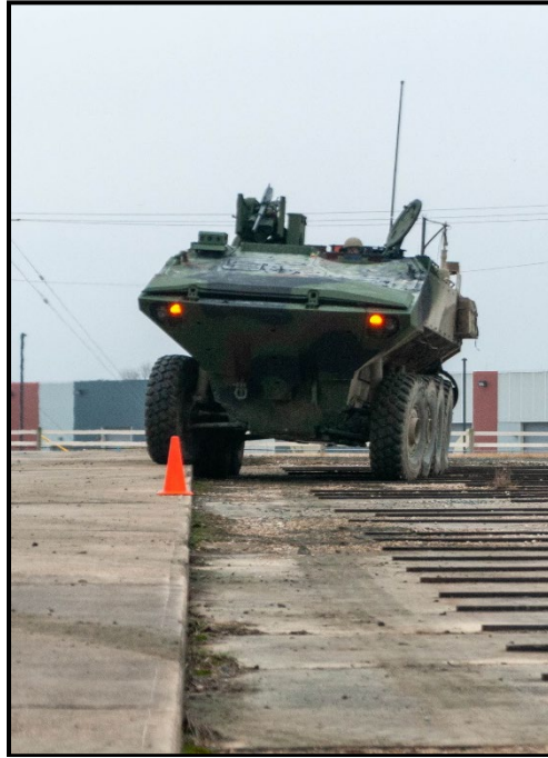
Figure 13. Vehicle negotiating the street curb.

b. For angle operations, orient the vehicle as required in the DTP. Operate the vehicle at a predetermined speed towards the curb in the forward or reverse gear to mount the obstacle.