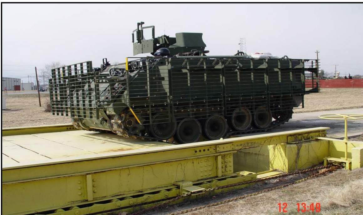
Figure 3. Tracked vehicle negotiating bridging device.

b. Operate the test vehicle over the set opening at minimal speed (Figures 3 and 4). Advance each road-wheel or tire slowly across the gap, stopping frequently as needed to minimize momentum.