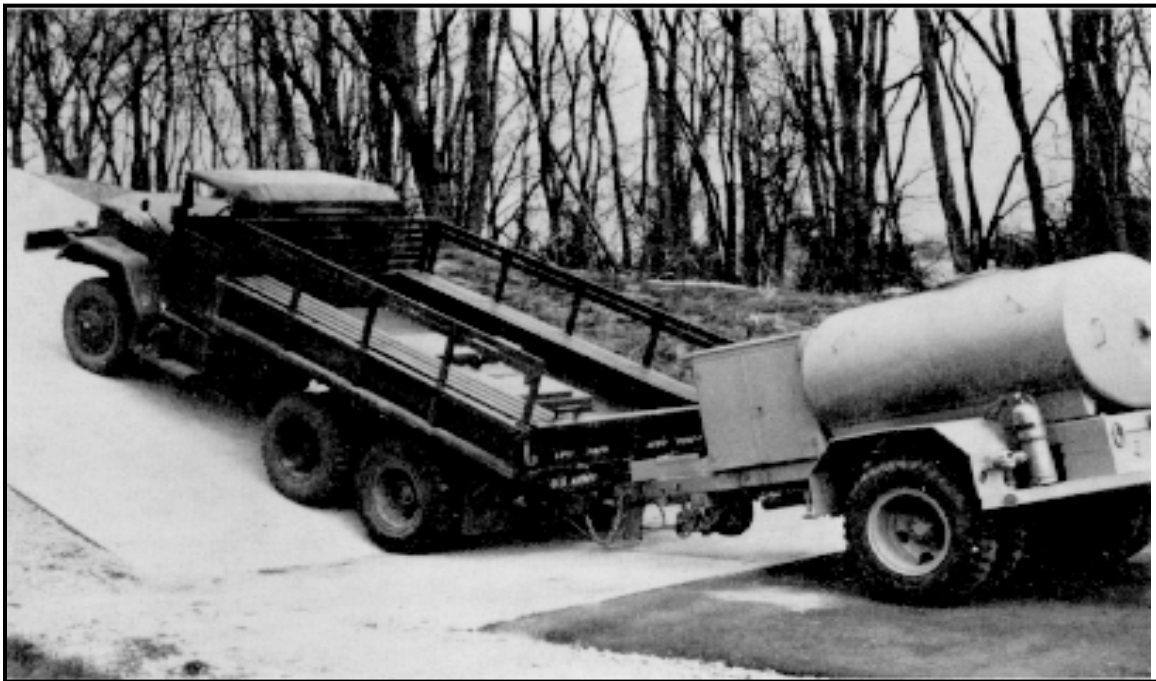
Figure 9. Vehicle ascending 20-degree loading ramp.

Tactical vehicles designed for transportation by either aircraft or ramp-equipped ships must be capable of entering and exiting the transporting vehicle by means of an inclined surface or ramp. The simulated loading ramp (Figure 9) enables vehicles to be tested for adequacy of approach and departure angles, ground clearance, and freedom of interference at the point of articulation between towed and towing vehicles.