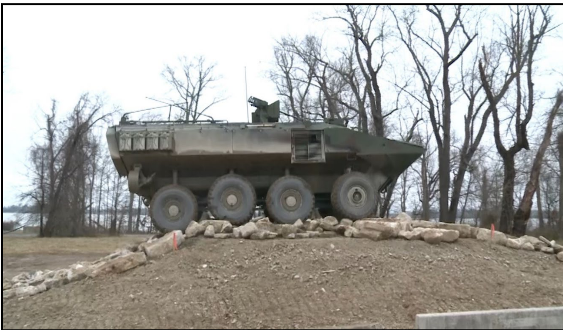
Figure 11. Vehicle negotiating rubble pile course illustrated in Figure 1.