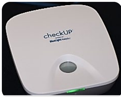
Figure 1: The CheckUP unit featuring a 17mm-diameter uniform active light collection port.