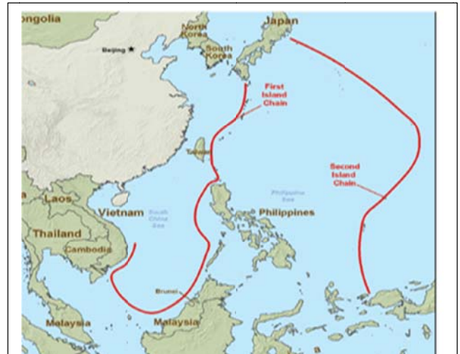
Figure 2. People's Liberation Army Active Offshore Defense Plan island chains 52

China's territorial claims and militarization of the South and East China Seas eerily mark an expansion eastward across the Pacific similar to, albeit more slowly than, Japan of the 1930s. North Korea represents the disruptive force that China was in the 1920s. North Korea and South Korea frequently engage in low scale violence in the form of artillery exchanges, naval skirmishes, and Special Forces operations. In addition, North Korea threatens armed conflict against the United States and its allies. These actions are disruptive and draw the U.S.'s attention away from other strategic operations in the region.