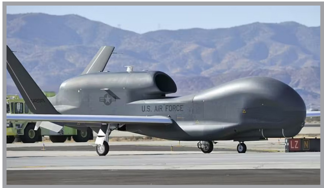
The Battlefield Airborne Communications Node (BACN) mounted in a RQ-4 Global Hawk

For example, the Battlefield Communications Node (BACN) began in 2006 as an Advanced Concept Technology Demonstration, intended to enable communications during deployed operations in locations with limited line-of-sight, such as in mountainous areas. BACN would provide a coalition-wide, high-altitude, communications relay between air, space, and ground systems across a range of dissimilar networks, typical of joint/Allied operations. In May 2009, BACN became a Joint