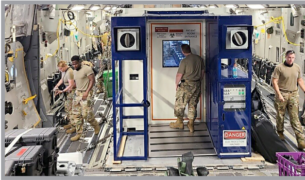
Negatively Pressurized Conex (NPC) onboard a C-17 Globemaster III