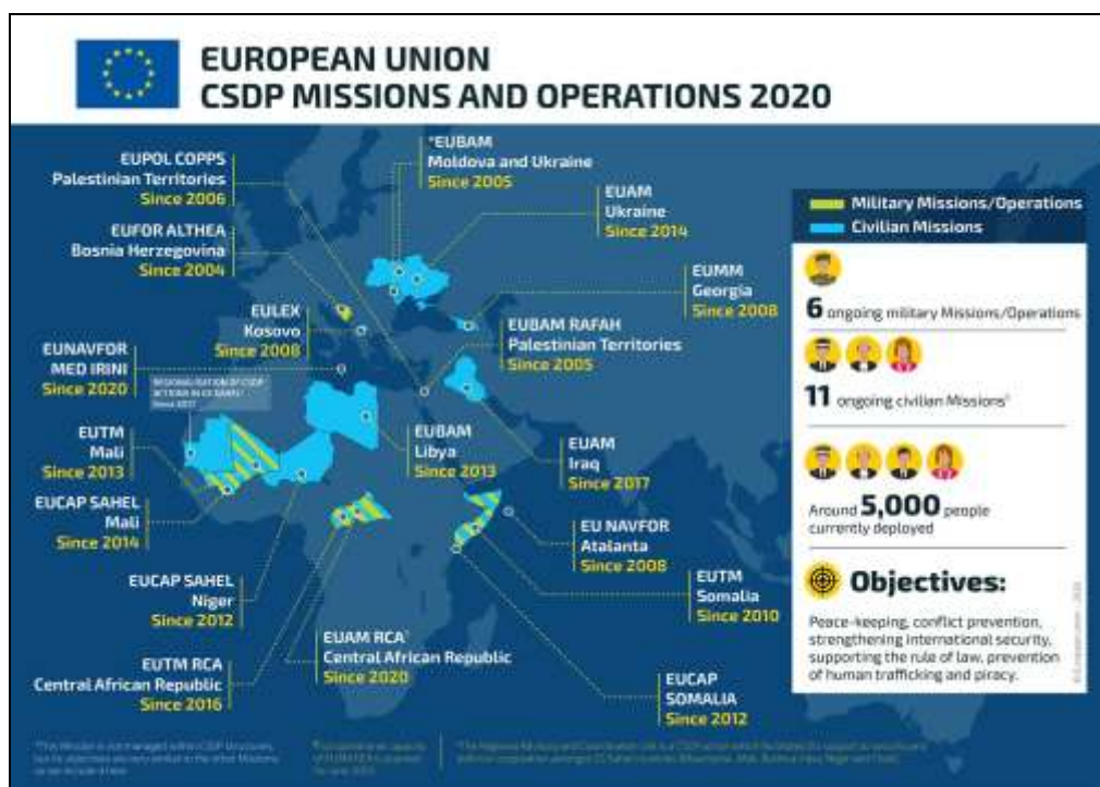
Figure 4: CSDP Current Mission and Operations. 77

supporting EUNAVFOR MED Sophia (1,137 personnel, €1.2 million), EUROF Althea (803 personnel, €2.22 million), and EUMAM RCA (700 personnel, €4.4 million) just to name a few. 76