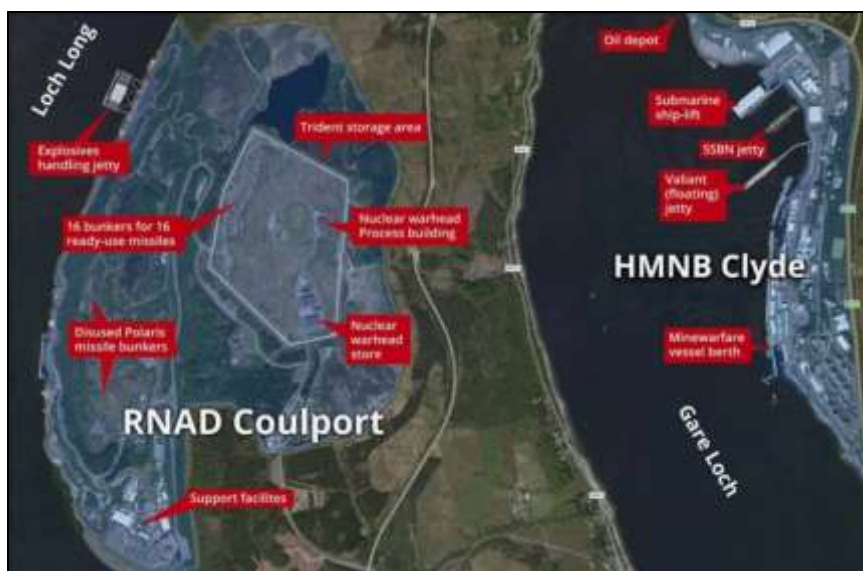
Figure 3: Trident facilities located in Scotland 36

The Trident program operates out of two main locations in Scotland; Naval Base Clyde in Faslane where the submarines are based and Royal Naval Armaments Depot (RNAD) Coulport where the Trident missiles are stored. 34 Figure 3 below depicts both facilities, which are only eight miles apart. 35 This eases the loading and unloading process of the Trident missiles, due to the close proximity. See Appendix B for further graphics on the facilities of both RNAD Coulport and Naval Base Clyde in Faslane.