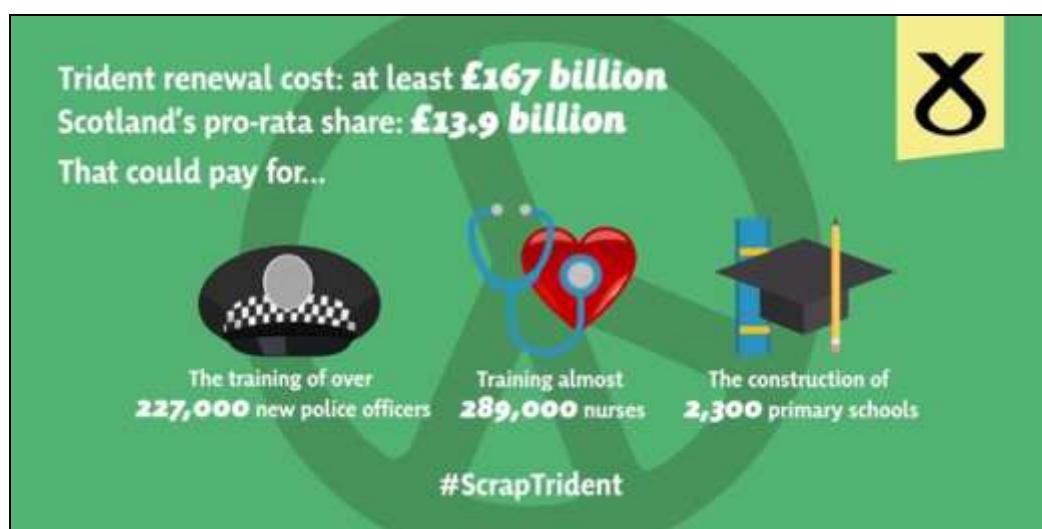
Figure 5: SNP Anti-Trident Propaganda. 162

this moment and it is a matter of time until London makes a decision between a second referendum and Trident. In the event Scotland did achieve independence, the SNP will ensure Trident is removed from Scotland and their written constitution would ban nuclear weapons from being based in Scotland, as they would most likely join the NPT. 158 The SNP will continue to campaign against nuclear weapons and has dedicated an entire webpage titled “Trident – What you need to Know.” 159 The webpage highlights how Trident does not address modern threats such as “terrorism, cyber-attacks, and climate change.” 160 Figure 5 shows propaganda displayed on the site that demonstrates what Scotland could pay for if not for the Trident renewal. 161