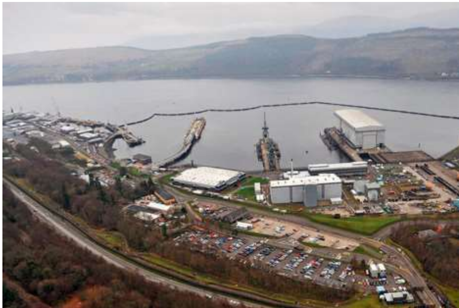
Figure 7: From left to right: Valiant Jetty, Finger Jetty and Shiplift building at Naval Base Clyde in Faslane