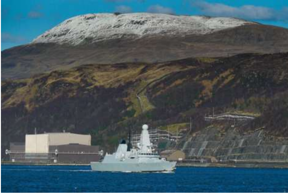
Figure 6: RNAD Coulport Explosives Handling Jetty (Trident loading area)