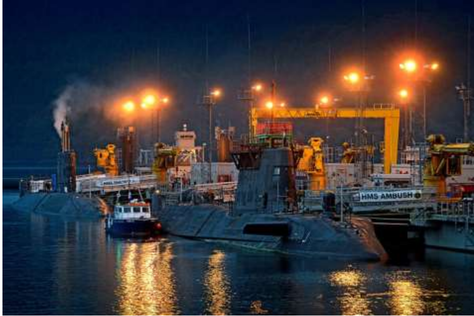
Figure 8: Valiant Jetty, Faslane. Attack submarines HMS Ambush and Triumph