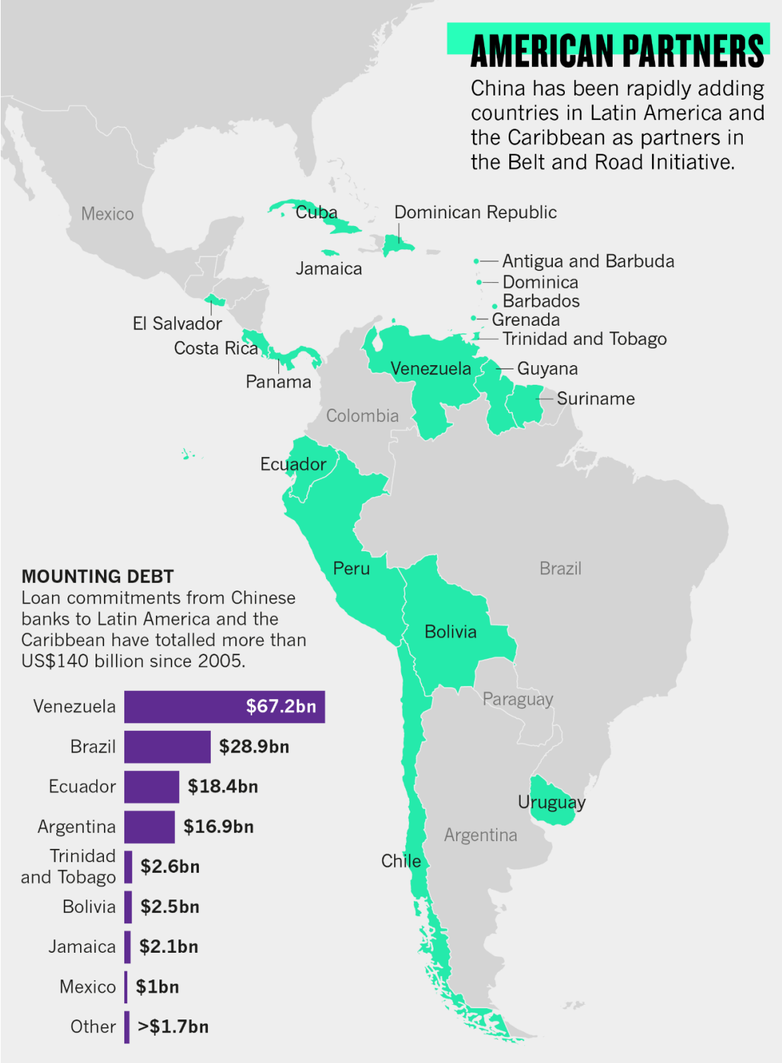
Figure 2. Chinese Partners in the LAC Region 36