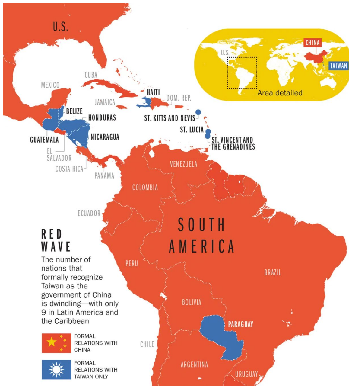
Figure 1. LAC countries with formal relations with China and Taiwan 9

Grenadines). 7 To accomplish the objectives mentioned above, the PRC combines a mix between economic diplomacy and people-to-people diplomacy or “charm offensive.” 8