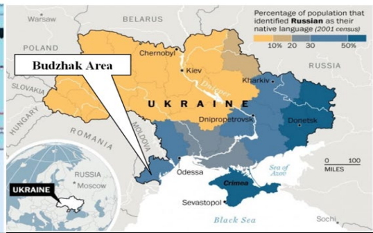
Figure 3: Percentage of Russian language speakers in Ukraine

Despite the fact that the Ukraine-Romania bilateral relationship has tremendous room for improvement, Romania should take the first step forward to improve the relationship. Ukraine's territorial integrity continues to be affected by the Russian military aggression in Donbas and the illegal annexation of Crimea. The beginning of a military cooperation between the two countries could send a message to Russia not to engage in future aggressive actions in the vicinity of Romania and Ukraine. A joint Romanian-Ukrainian effort to defend Snake Island, backed up by