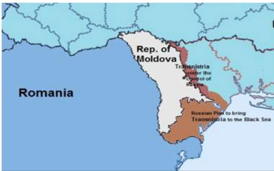
Figure 2: The Republic of Moldova, Moldovan Transdniestrian & Ukraine's Budzhak Region

Russia would be expected to declare that Kyiv is a threat to Transdniestria to justify an offensive campaign in territory that it considers to be Russian. Besides supporting pro-Russian separatists in southern Moldova, Russia would then have access to the entire coastal area between Romania and Odessa. To strengthen its presence in the region, Russia then “may threaten both Romania and Ukraine with partition by backing the creation of a Budzhak Republic in southern Moldova to include Gagauzia in Moldova and parts of Odessa oblast in Ukraine.” 18 Romania would then be in direct contact with Russian-controlled territory.