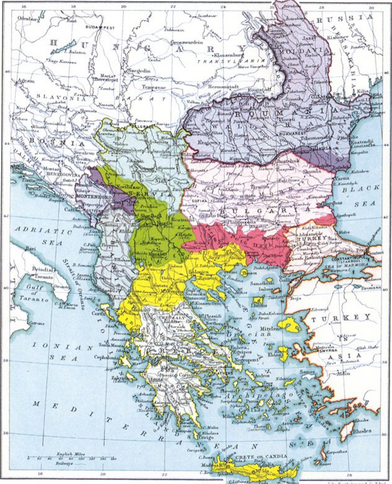
Map 2: The Balkan Peninsula in 1913

With New Frontiers according to Treaties of London, Constantinople, & Bukharest.