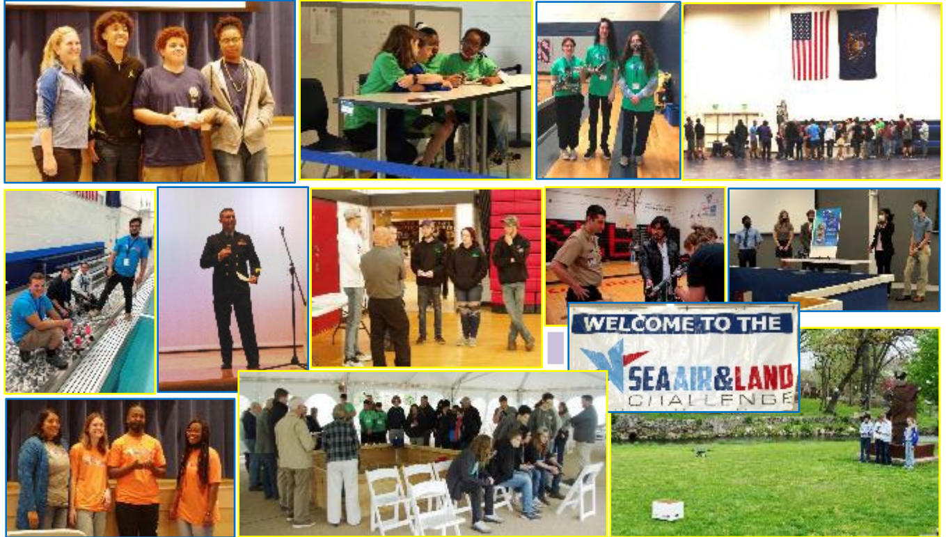
2022 Sea Air and Land Challenge Photos