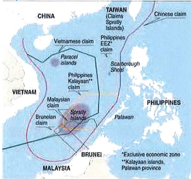
Disputed South China Sea Claims

the U.S. Navy from waters near its South Seas Fleet bases and sensitive military sites in its