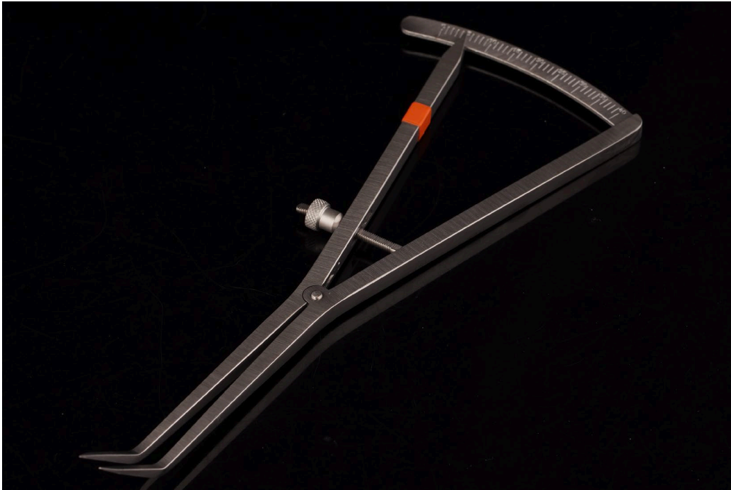
Figure 3. Castroviejo Calipers. A standard Castroviejo caliper with markings to identify millimeter increments up to 40 millimeters.