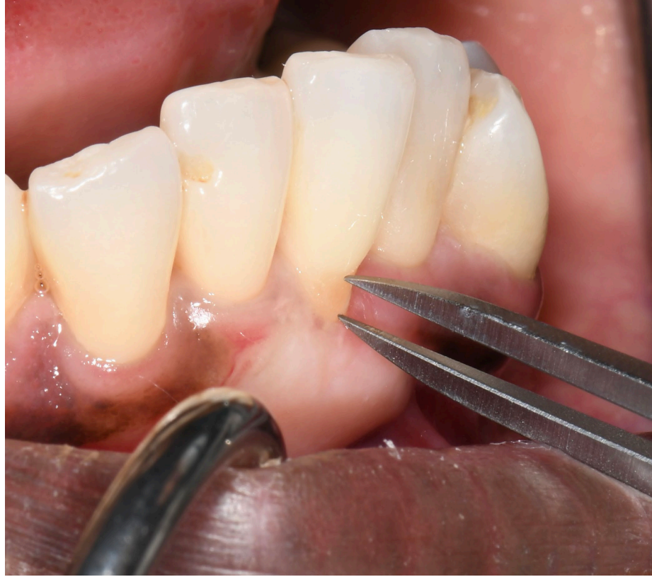
Figure 7. Castroviejo Calipers Measuring Recession. Castroviejo calipers measure recession from the CEJ to the FGM.