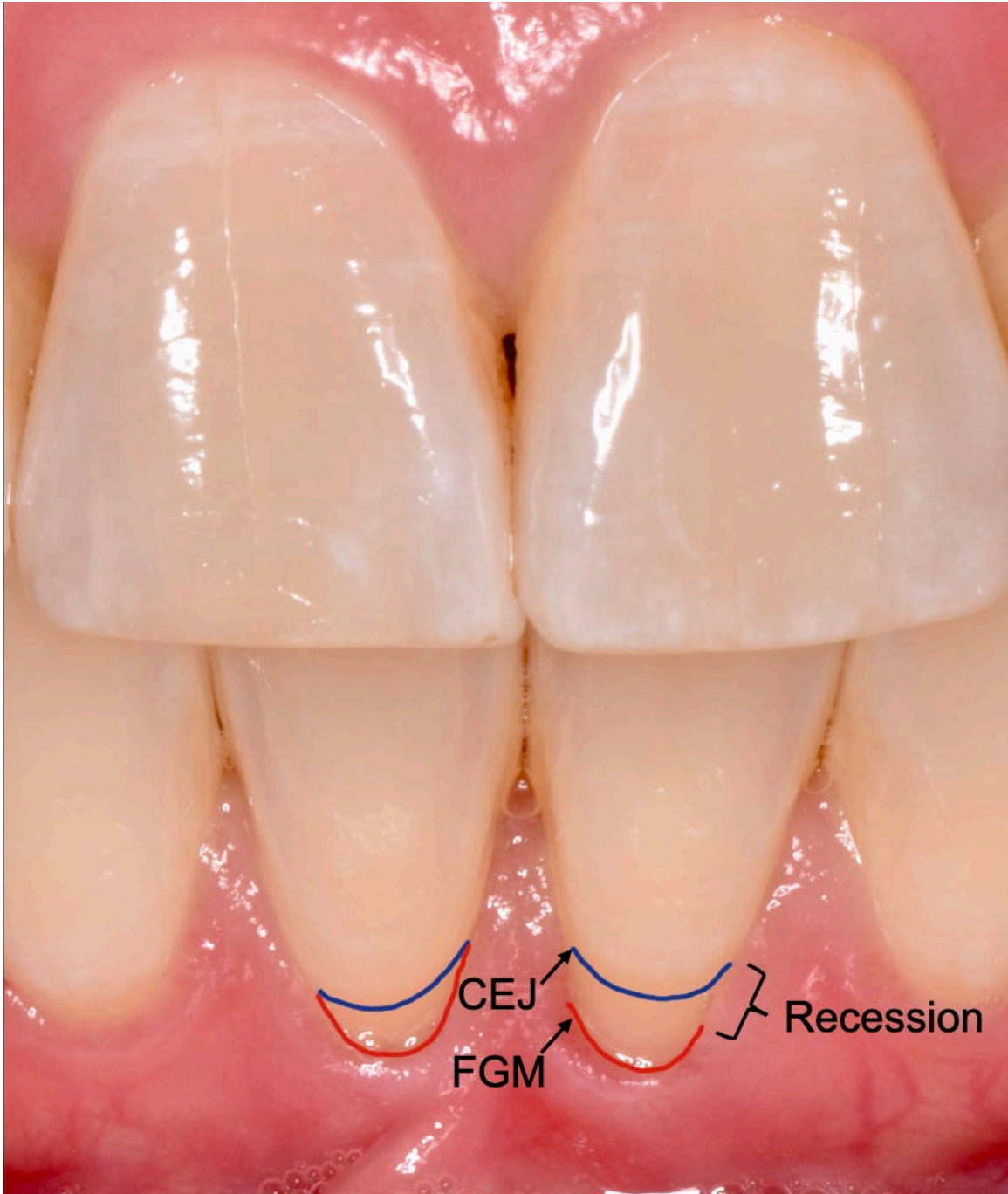
Figure 1. Gingival Recession Identification. Recession is identified by measuring the distance between the cemento-enamel junction (CEJ) and the free gingival margin (FGM).