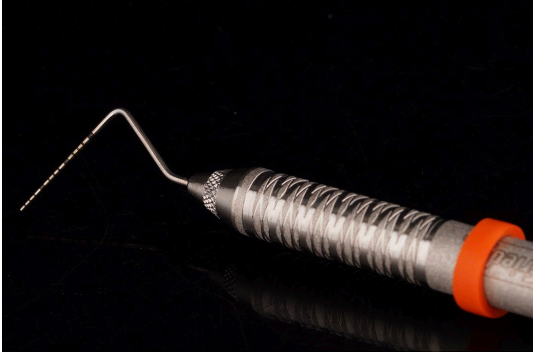
Figure 2. Periodontal Probe. A standard UNC-15 periodontal probe with markings to identify millimeter increments up to 15 millimeters.