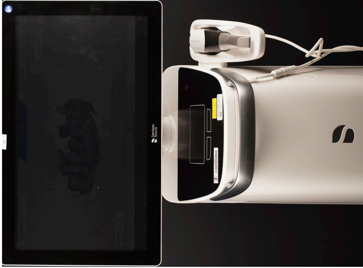
Figure 4. Intraoral Video Scanner. The base unit of the intraoral digital video scanner includes the video capturing handpiece, a touch screen, and keyboard. The unit has the ability to store data long-term.