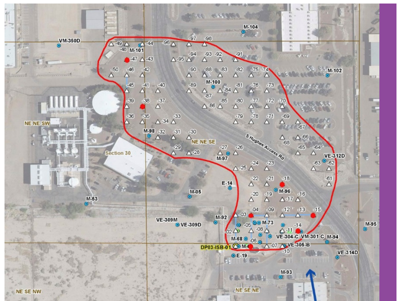
Map of the treatment system for ISBR implementation at the DP003 source zone. The white triangles represent the wells used for hydrofracturing-enhanced injection of amendments. The pictured region is approximately 300 by 300 meters.