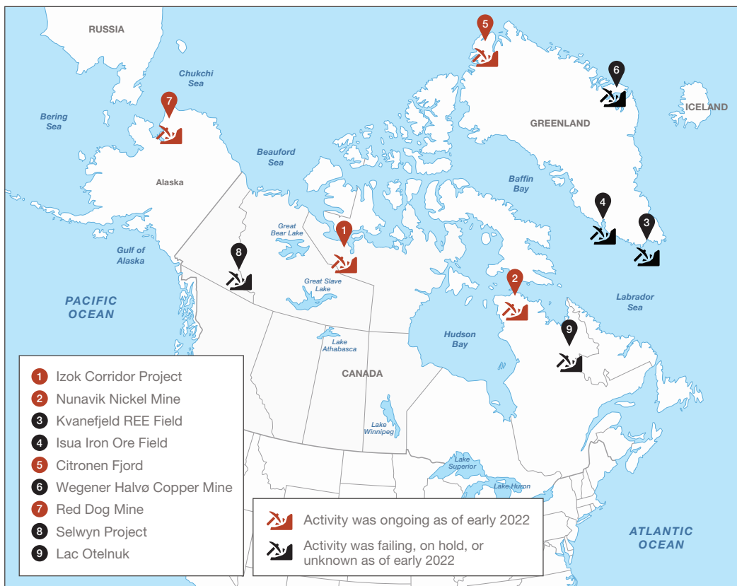
FIGURE 3.2 Map of Chinese Mining Investments and Activities in the North American Arctic

SOURCES: Data drawn from various sources as detailed in Appendix C.