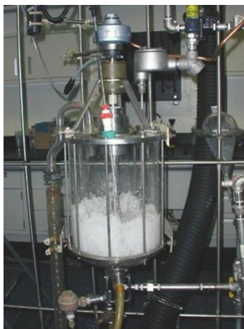
Figure 3 Slurry still used to produce pressing powders

Pressing powders are produced in large quantities through a slurry coating technique (fig. 3). Solvent-based lacquers of polymeric binder systems are added to solid ingredients suspended in a stirring nonsolvent. Distillation of the lacquer solvent causes binder deposition onto the solid particle surfaces creating agglomerates, which can be filtered and dried to remove all processing liquids. Scaling down this operation to investigate small quantities of new materials suitable for these formulations is difficult because mixing regimes in large vessels are difficult to replicate in small volume reactors.