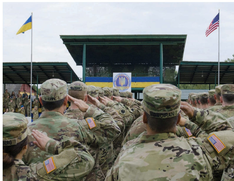
U.S. soldiers with the California Army National Guard and the Oklahoma Army National Guard render salutes during the official opening ceremony for Rapid Trident 17 on September 11, 2017, at the International Peacekeeping Security Center in Yavoriv, Ukraine.

THE FUTURE OF UKRAINE. Although there is no trade space for cooperation with Russia when it comes to the ultimate vision for Ukraine's future (i.e., pertaining to its prospects for EU or NATO membership), there is some space to cooperatively advance conflict resolution based on the Minsk II agreements. There is also space for cooperation on the more modest goals of limiting hostilities and the worst humanitarian consequences of the conflict in Ukraine's East and constraining the potential for the conflict to escalate or spill over. Although Russia's aggression set off the conflict, which then plunged relations between Russia and the West to a post-Cold War low, the conflict cannot realistically be settled without Russia's participation.