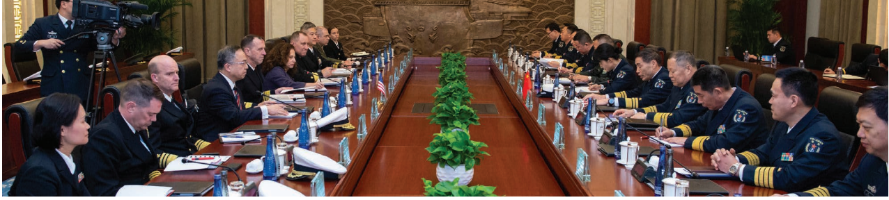
Chief of Naval Operations Adm. John Richardson meets with senior Chinese defense officials at the People's Liberation Army (Navy) headquarters in Beijing on January 14, 2019. Richardson was on a three-day visit to Beijing and Nanjing to encourage professional interactions at sea, specifically addressing risk reduction and operational safety measures to prevent unwanted and unnecessary escalation.

EXPANDING STRATEGIC COOPERATION WITH INDONESIA, MALAYSIA, AND VIETNAM. When it comes to Southeast Asia, American and Russian interests are not completely misaligned. The United States would prefer these countries to buy weapons from the United States or its allies, but Russian arm sales to Indonesia, Malaysia, and Vietnam still indirectly benefit American interests because those arms are most likely to be directed against Chinese forces. And Russian-owned corporations are cooperating with Vietnamese companies on resource extraction within China's self-proclaimed Nine-Dash Line in the South China Sea, suggesting that Russia may be willing to pursue its own economic interests even when they contradict China's preferences. But Russia's willingness to challenge China goes only so far. Russia has not expressed clear support for China's Nine-Dash Line claim, but it has consciously avoided taking Vietnam's side and declined to mediate the dispute when Vietnam asked.