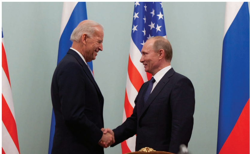
Then-Vice President Joe Biden greets Russian Prime Minister Vladimir Putin at the Russian White House, in Moscow, March 10, 2011.

Arguably, the most difficult obstacle to overcome is distrust . Trust revolves around perceptions of an adversary. What is more, this obstacle is growing—a trust deficit . International institutions should be one way to mitigate this lack of trust, but thus far they have not succeeded in doing so. As the United States' trust in Russia and China declines (and vice versa), the distrust obstacle will become increasingly significant, making other obstacles that much harder to overcome and cooperation in the future that much more difficult and less likely.