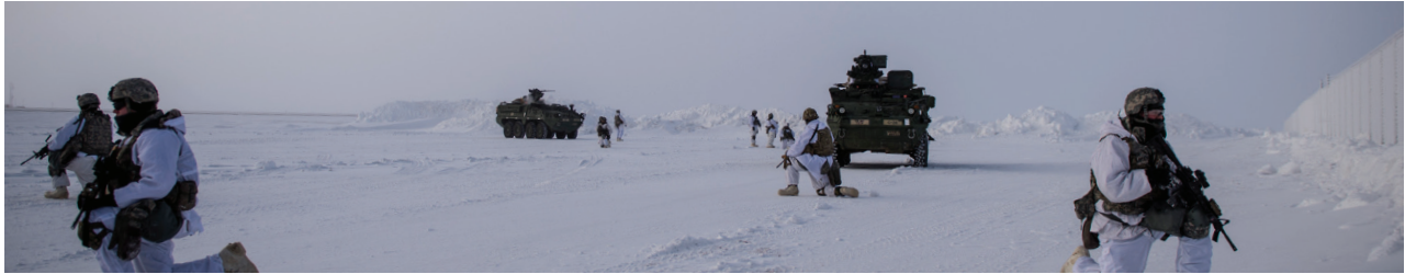
Soldiers provide overwatch during a deployment of Stryker armored vehicles as part of the U.S. Army Alaska-led Arctic Edge 2018 exercise held at Eielson Air Force Base, Alaska, March 13, 2018. Arctic Edge 2018 is a biennial, large-scale, joint-training exercise that prepares and tests the U.S. military's ability to operate tactically in extreme cold-weather conditions found in Arctic environments.

crime, the criminalization of its politics, and its preference for methods of cooperation that give it control over the effort.