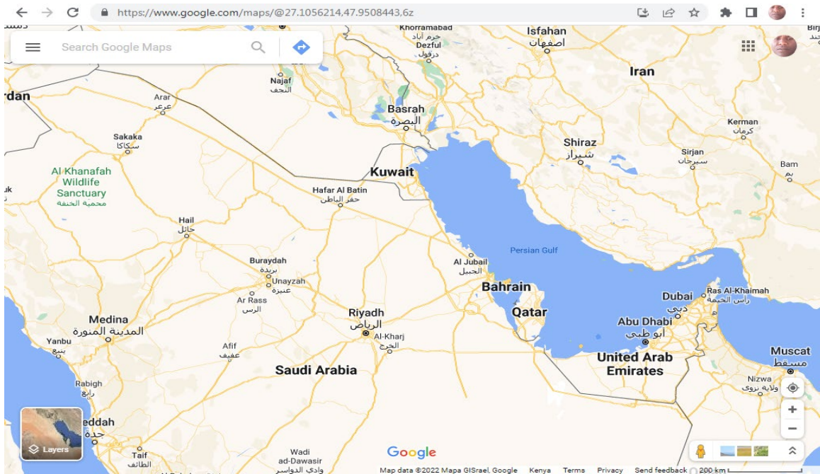
Figure 1. Strait of Hormuz