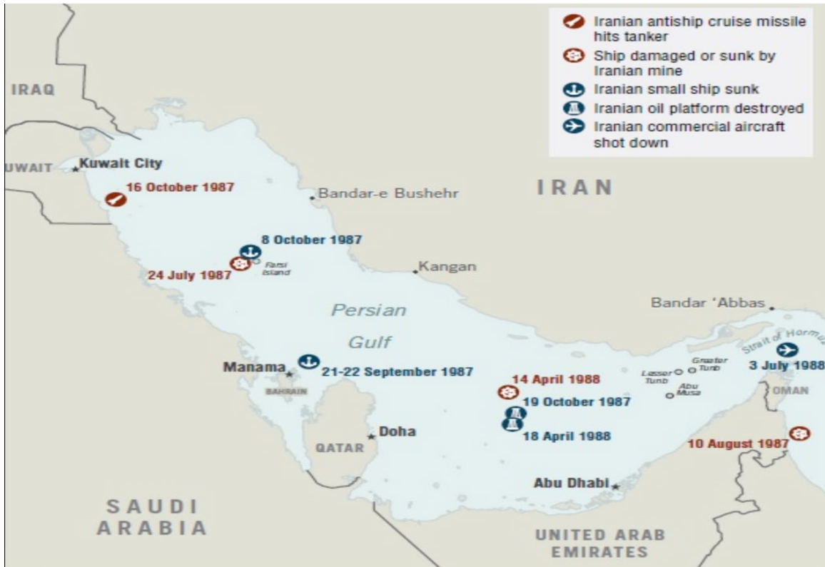
Figure 4. Map of Tanker War 1987–1988 101