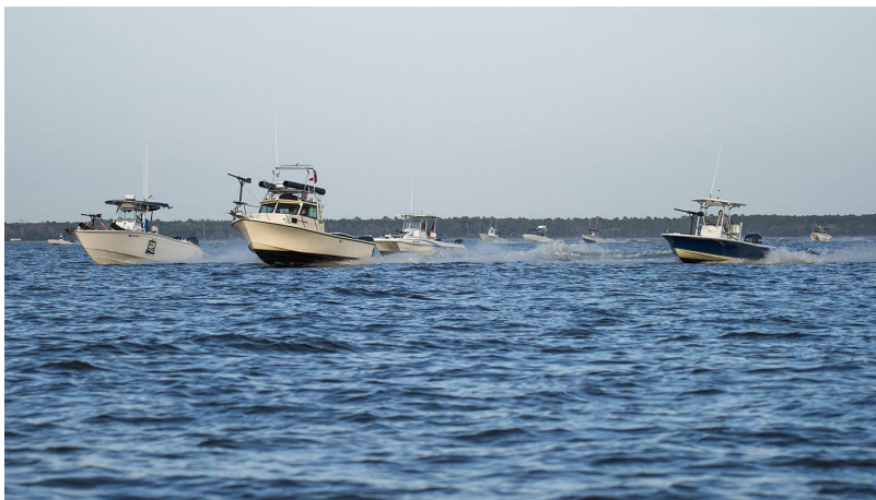
Figure 6. Iranian Small Boat Swarm 116

Iran has utilized its small craft to harass maritime vessels in the Strait of Hormuz and the Persian Gulf since its inception in the 1980s. Several significant incidents will be examined, presenting the habitual conduct of the IRGCN with its Fast-Inshore Attack Craft (FIAC) and Fast Attack Craft (FAC) and how these tactics continue to be troublesome to maritime traffic in the region. While swarm tactics are not new, the development and application of new weapons systems and navigation technology have made this threat a more immediate challenge for the United States to detect, determine intent, and counter. 115 Restricted maneuverability of larger vessels in and around the Gulf was and continues to be a considerable advantage to Iranian swarming tactics. See Figure 6.