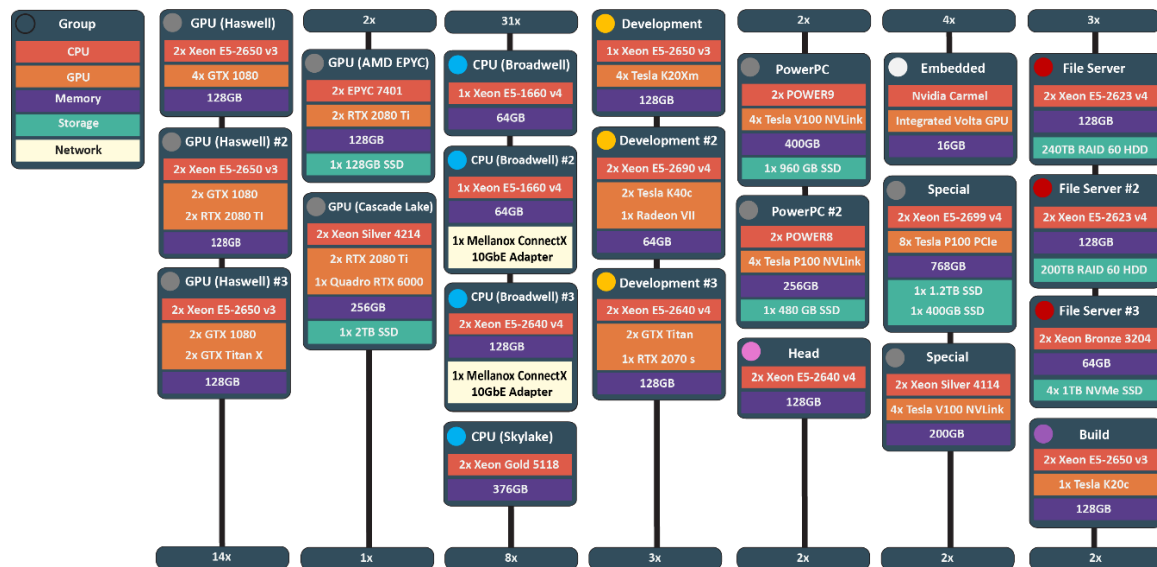
Figure A. Schematic of Euler. The CPU-GPU cluster has more than 80 GPU cards using the Maxwell, Pascal, Volta, and Ampere architectures.

Finally, the cluster is used in instructional activities, where students get accounts for one semester to learn about HPC. For instance, I’ll be teaching in Fall the class ME759: High Performance Computing for Applications in Engineering . This class is a PhD level class that draws between 70 and 100 graduate students each time is taught. Because of the DURIP funding, which over the years allowed me to keep this cluster up to date, this highest-level class in the College of Engineering at UW-Madison became the largest graduate course within the entire college (made up of 12 departments).