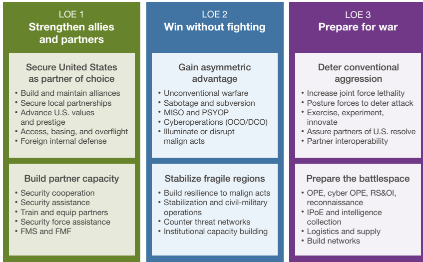
FIGURE S.1 Objectives Framework

NOTES: FMF = Foreign Military Financing; FMS = Foreign Military Sales; LOE = line of effort; MISO = military information support operations; PSYOP = psychological operations; OCO/DCO = offensive and defensive cyberoperations; OPE = operational preparation of the environment; RS&OI = reception, staging, onward movement, and integration; IPoE = intelligence preparation of the operational environment.