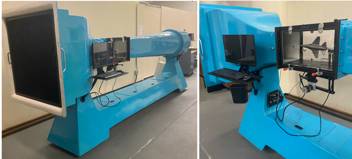
Low Speed Open Circuit Wind Tunnel

The wind tunnel is commissioned and is currently being used by the undergraduate students. A team of undergraduate students is using to conduct research on the wake of a surface-modified circular cylinder through wake-velocity surveys. This will be followed by VPIV measurements. The students will be presenting their work at the regional AIAA Student Conference.