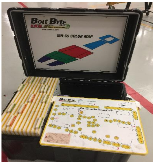
Figure 3. Card.

STIC team market research yielded the Bolt Byte System. The system consists of a series of cards that have the fastener pattern of each floor plate in the aircraft. As shown in figures 2 and 3, the floor plates are each depicted in the diagram on the cover of the storage box. Each floor plate is color-coded. The cards are also coded in the same color as the diagram.