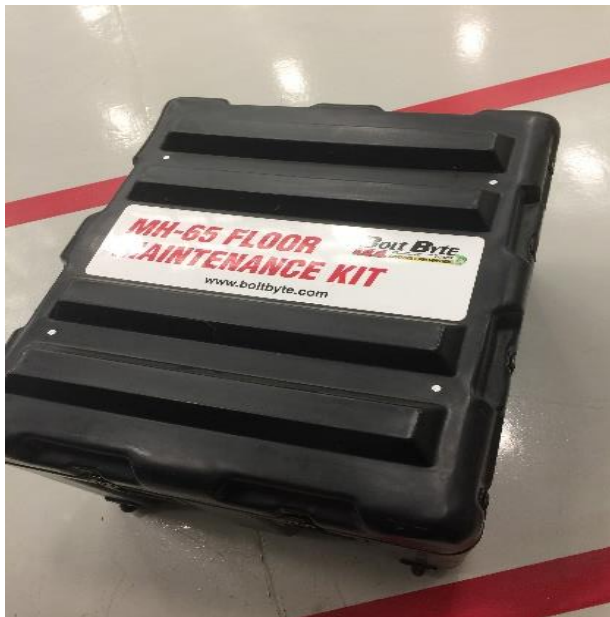
Figure 1. Storage case for the MH-65 hardware kit.

An issue that MH-65 helicopter aviation mechanics were having was brought to the attention of the STIC team. When MH-65 deck plates are removed for maintenance, there are many fasteners that must be reinstalled in the same orientation in which they were removed. This is due to differing lengths of the fasteners. The length is critical because the equipment and structures are dependent on the lengths so as to not interfere with the equipment below. One particularly important area under the floor is the fuel tank.