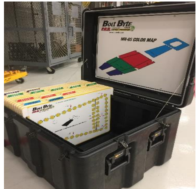
Figure 2. Internal storage for the cards.

In the past, technicians previously fabricated crude cardboard placemats to hold the hardware as it was removed. The hardware was being inserted into these homemade cardboard cards but inevitably got mixed up or even went missing. It was determined that there must be a better way to keep track of the hardware and to ensure correct reassembly. A system or tool was needed that allowed the technician to securely place and store the hardware in an exact location every time a deck plate was removed.