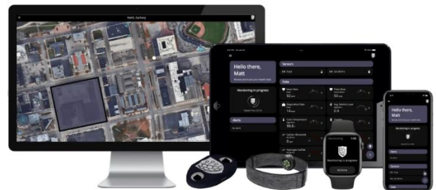
Figure 1. Sentinel Safeguard System.

combined with strenuous exercises while wearing a large amount of equipment can result in heat stress injuries. They also conduct training and operations in extremely cold environments, often with members exposed to wet conditions where hypothermia is a concern. For these missions and training events it would be ideal to have real time operator health monitoring system available to assist in determining when an operator's core temperature or other indicators determine that the member is outside of safe health parameters.