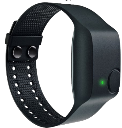
Figure 2. Empatica E4 Wristband (E4 Wristband Factsheet, 2020)