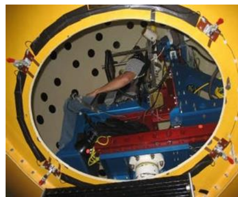
Visual Vestibular Sphere Device