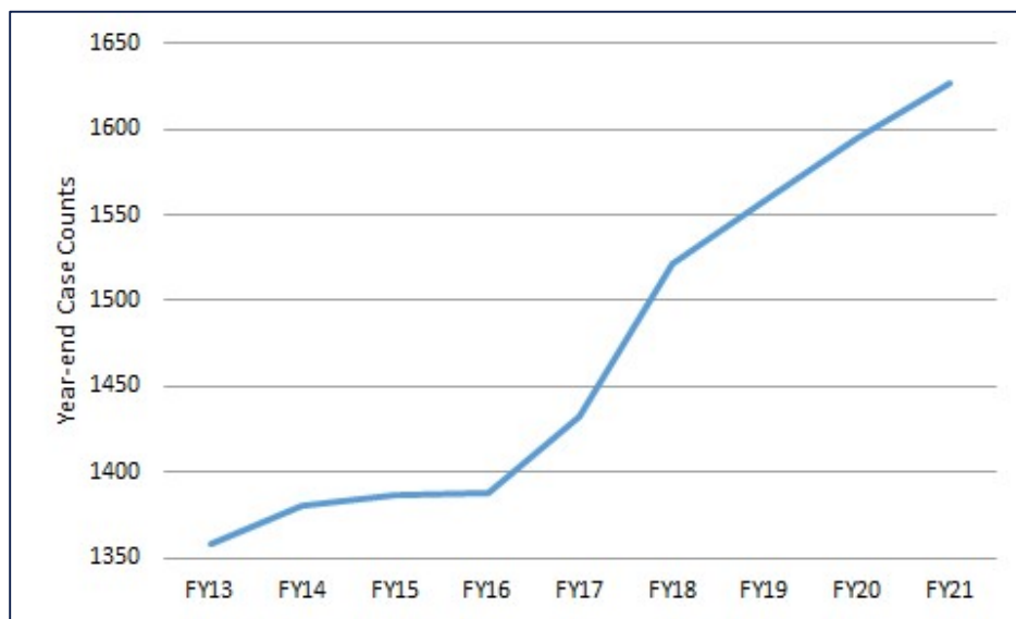
Figure 1. USMC EFMP ABA Cases Fiscal Year 2013 through Fiscal Year 2021

The study team calculated the number of cases per year with children requiring ABA services. Figure 1 shows the results of the analysis. The number of EFMP-enrolled cases per year requiring ABA has increased every year since 2013 even when Marines end strength decreased. It has risen by nearly 20% since 2013 with the steepest increases from 2016–2021.