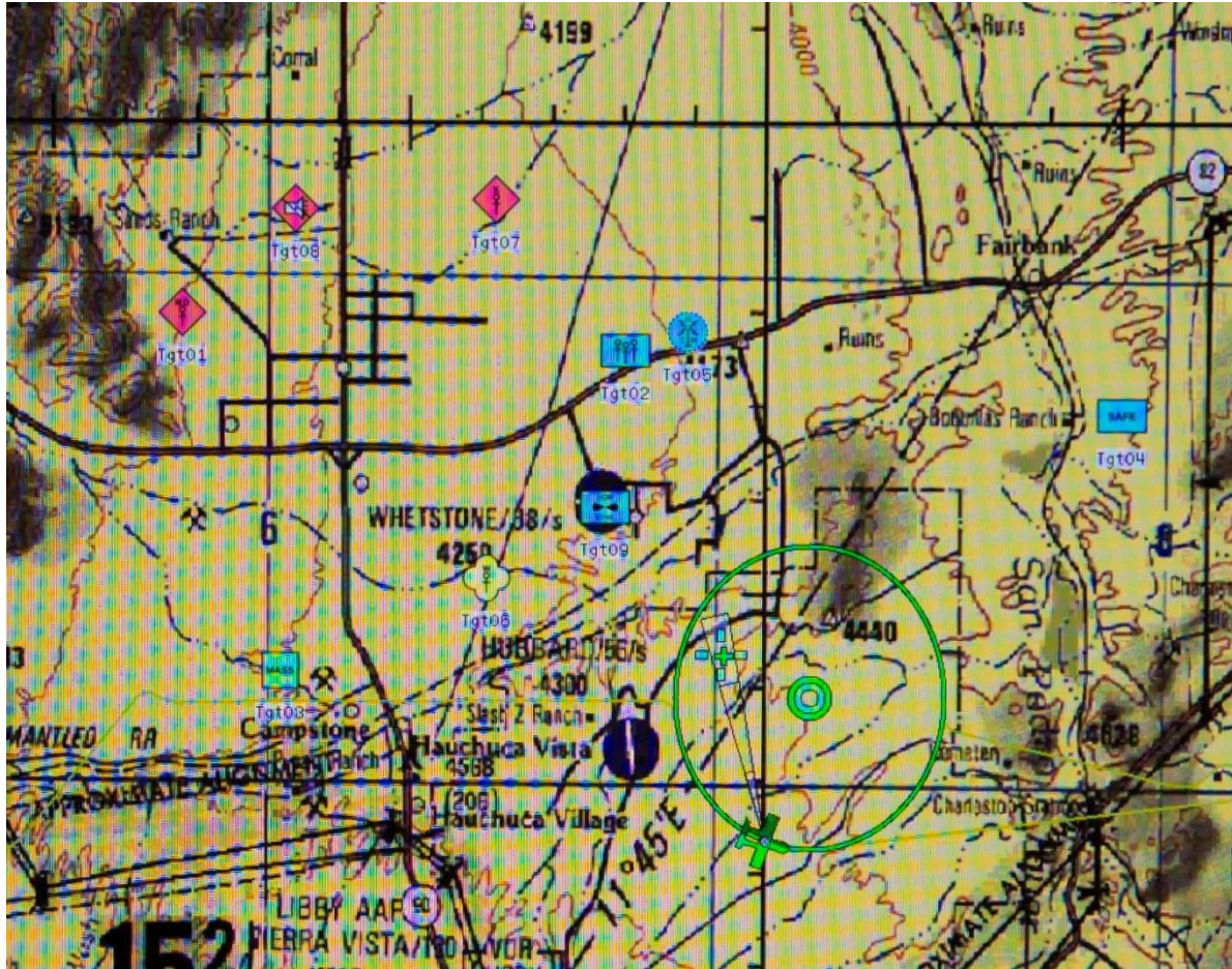
Figure 2. Example of map and symbols in supervision task.