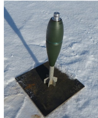
Figure 1. Example CD setup of an 81 mm mortar cartridge

Command detonation (CD) enables a munition to be fired in static position at a testing location where energetic residues can then be collected and analyzed. This technology enables quantification of energetic residues early in the acquisition process, before a munition is certified for live fire from a weapon system, and it provides critical data for environmental impact assessment. Key uncertainties in this practice are whether the required replacement of the munition's fuze with a fuze simulator and static upright positioning accurately represent residue loading as it occurs during live fire. This study leveraged energetic residue data from previous SERDP-funded CD tests of 60 mm and 81 mm IMX-104 mortar munitions that used fuze simulators developed by CRREL (CFS) and the DEVCOM Armaments Center (AFS). Residues from these previous CD tests were recovered from deposition on snow—a clean, sensitive medium.