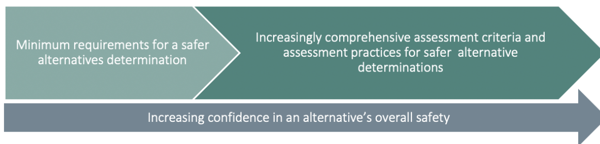
FIGURE 1. Organization for Economic Cooperation and Development's (2021) Spectrum of Safer Criteria for the Selection of Alternatives to Priority Substances

The use of minimum requirements for evaluating and making a determination about safer alternatives has also been adopted by government agencies and NGOs for use in regulatory programs and purchasing, including: