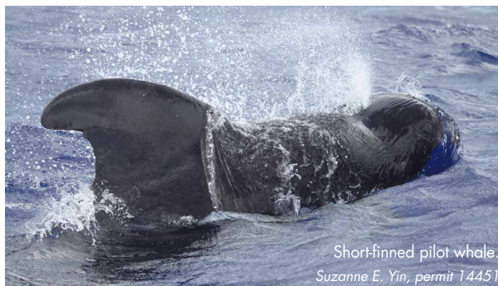
Short-finned pilot whale. Suzanne E. Yin, permit 14451

sightings, the team was able to deploy four tags with the prototype elastic anchors on short-finned pilot whales. The four tags remained attached and three of the four were transmitting over several days. While follow-up visual monitoring will continue as possible, the first photos of two tagged animals showed no issues at the implant sites. The next test effort is planned for January 2024 in southern California on fin, blue or beaked whales.