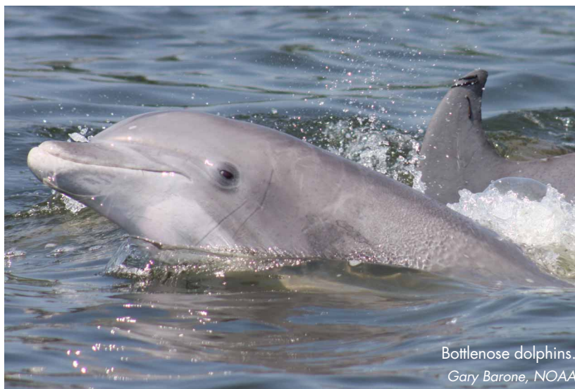
Bottlenose dolphins.