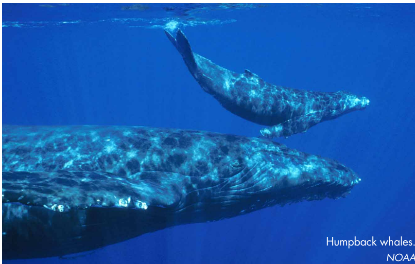
Humpback whales.