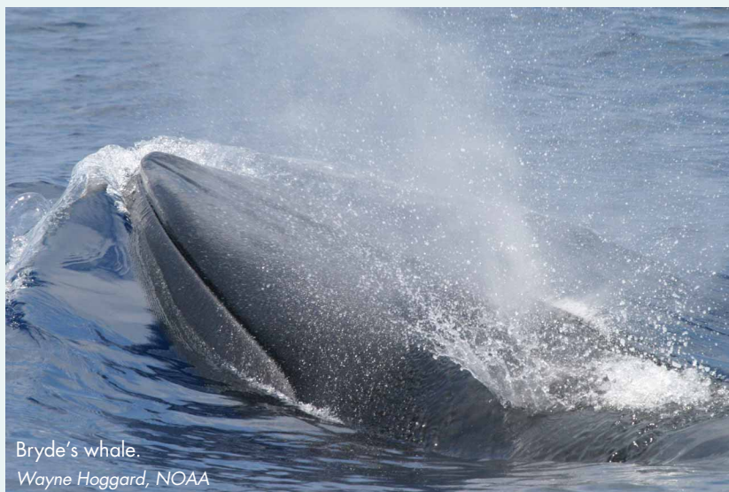
Bryde’s whale. Wayne Hoggard, NOAA

The team identified seasonal and day/night (diel) patterns of movement and calls. Tracks were organized into three seasonal groups with most tracks falling within one season and showing a distinct directional heading. Bryde’s whale swam faster in the daytime and slower at night. Applying a labor-intensive process to analyze and manually add missed calls, the team was able to obtain accurate inter-click intervals (ICI) and call types. There is some indication that the median ICI is lengthening over time for Bryde’s whales. The results may offer insights into population groupings around Pacific regions and will contribute to cue rates needed for