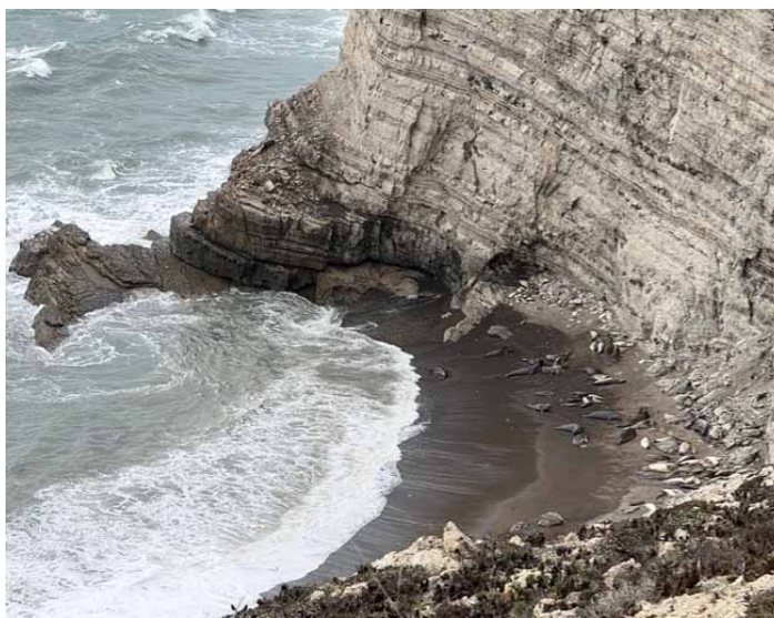
Well-camouflaged elephant and harbor seals hauled out on a protected beach.

With many overlapping permitting responsibilities, from the Marine Mammal Protection Act to the Endangered Species Act and National Environmental Protection Act, these resource managers found significant common ground and shared new ideas for meeting the requirements. The participants saw potential opportunities for collaboration.