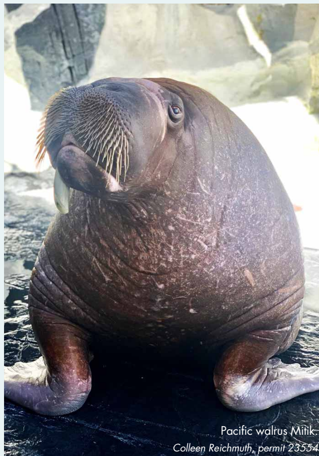
Pacific walrus Mitik. Colleen Reichmuth, permit 23554