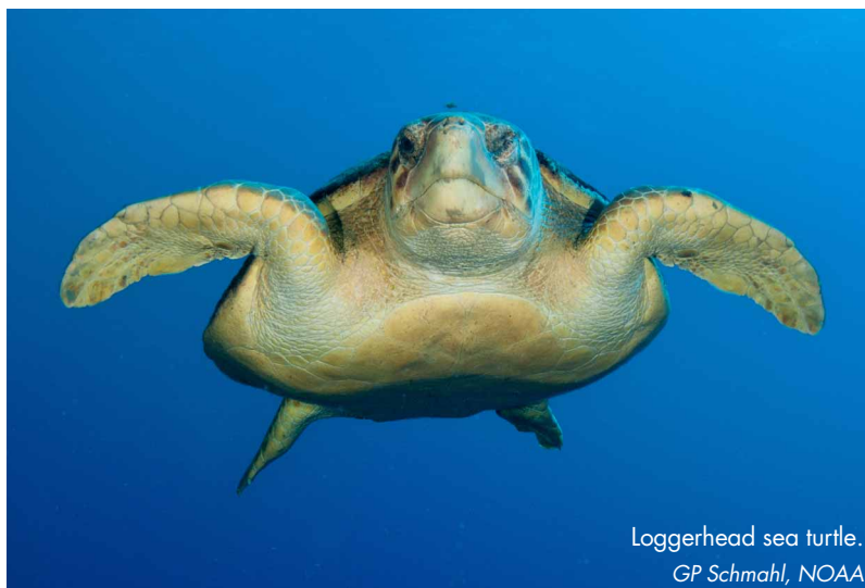
Loggerhead sea turtle.