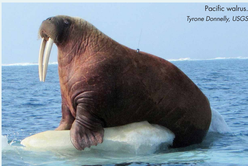
Pacific walrus.