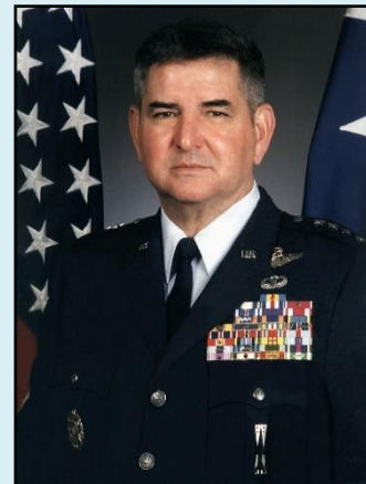
General Ronald R. Fogleman, 15th Chief of Staff, United States Air Force

The other Services have air arms—magnificent air arms—but their air arms must fit within their Services, each with a fundamentally different focus. So those air arms, when in competition with the primary focus of their Services, will often end up on the short end, where the priorities for resources may lead to shortfalls or decisions that are suboptimum. It is therefore important to understand that the core competencies of [airpower] are optional for the other Services. They can elect to play or not play in that arena. But if the nation is to remain capable and competent in air and space [sic], someone must pay attention across the whole spectrum; that is why there is a US Air Force.