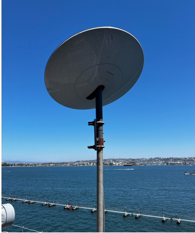
Figure 3. Starlink Terminal Mounted on Port Quarter