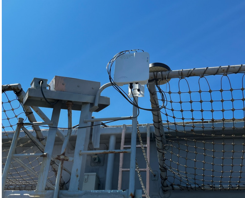
Figure 4. Cradlepoint W2005 Antenna Mounted on Port Quarter

While a direct quote from T-Mobile could not be obtained, we deemed it essential to factor in the potential of their services, given their superior coverage. Reverse-engineering Verizon's pricing led us to an estimated monthly cost of $160 per SIM card. Recognizing that T-Mobile's rates are likely different, we proceeded with the assumption that they matched Verizon's pricing for analytical purposes. Drawing on T-Mobile's bandwidth tests on ABE, we determined that six SIM cards would be necessary to attain comparable internet speed and quality to Cox. This configuration requires three Cradlepoint antennas, resulting in an initial investment of two extra units in Year 0 and the replacement of all three units in Years 4 and 8. The service cost for six SIM cards amounts to $960 per month, or $4,800 per year for a given five months in-port. Table 11 outlines the key expenses necessary for ALT2.